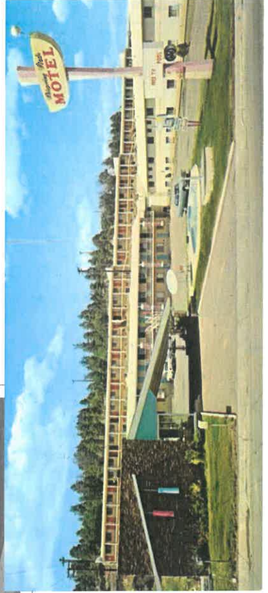
Reference Photo Only | Scale: NTS