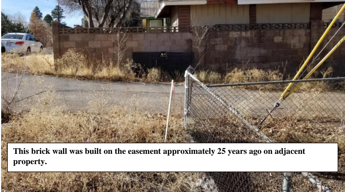
This brick wall was built on the easement approximately 25 years ago on adjacent property.