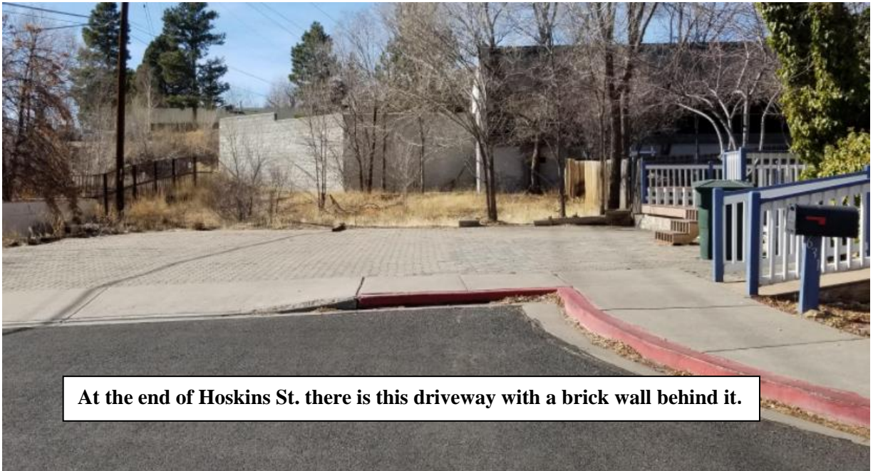
At the end of Hoskins St. there is this driveway with a brick wall behind it.