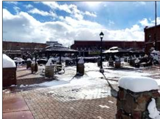
Heritage Square after