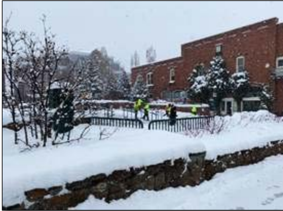
Heritage Square before

including those receiving difficult phone calls, those operating machinery in the tough-to-reach locations, and of course all the hand shovelers! The teamwork demonstrated in this storm was something to behold, and we could not have done it without all of our partners. Some images to enjoy: