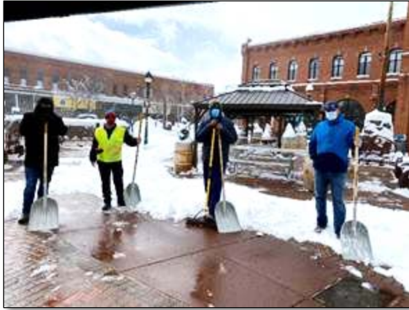
PW Director joining the fun (on the right)