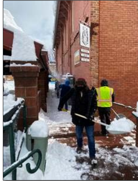
Clearing snow - parking garage canopy

Parks is partnering with Recreation staff to assist with the labor-intensive snow operation at Heritage Square due to the many tables, wine barrels, and gazebos that require more time and effort. ParkFlag is assisting as well when applicable.