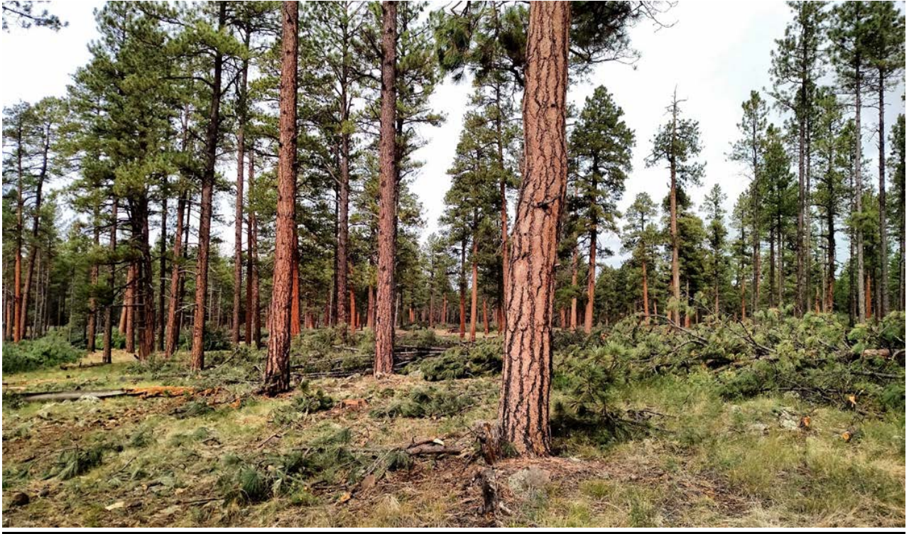
Ponderosa pine mechanical thinning in the FWPP footprint