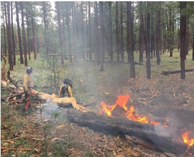
Crew 1 assisting with a lightning caused fire on Observatory Mesa