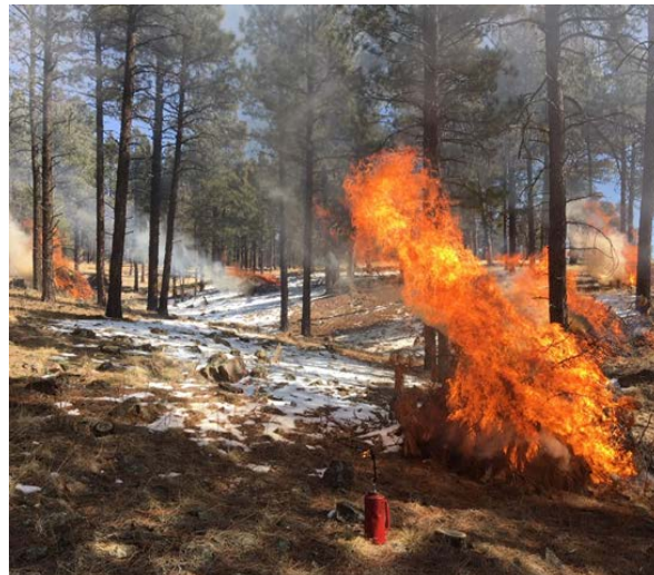
Pile burn operations were conducted on Observatory Mesa