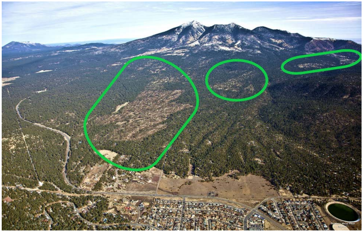
Mechanical thinning efforts within the FWPP footprint