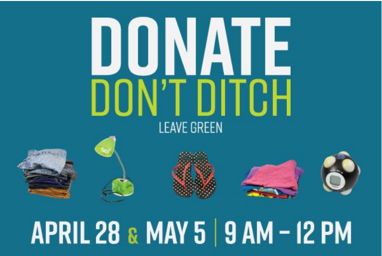
Donate Don't Ditch