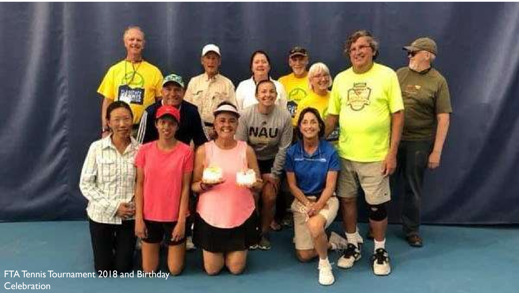
FTA Tennis Tournament 2018 and Birthday Celebration