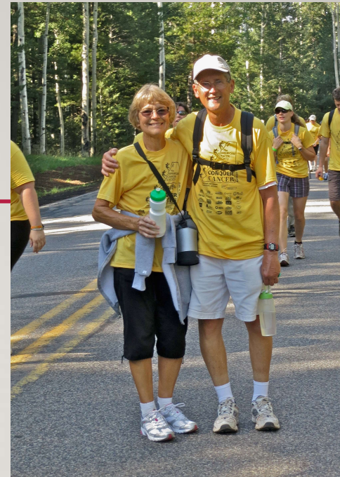
Walk for Cancer, August 18 th , 2012