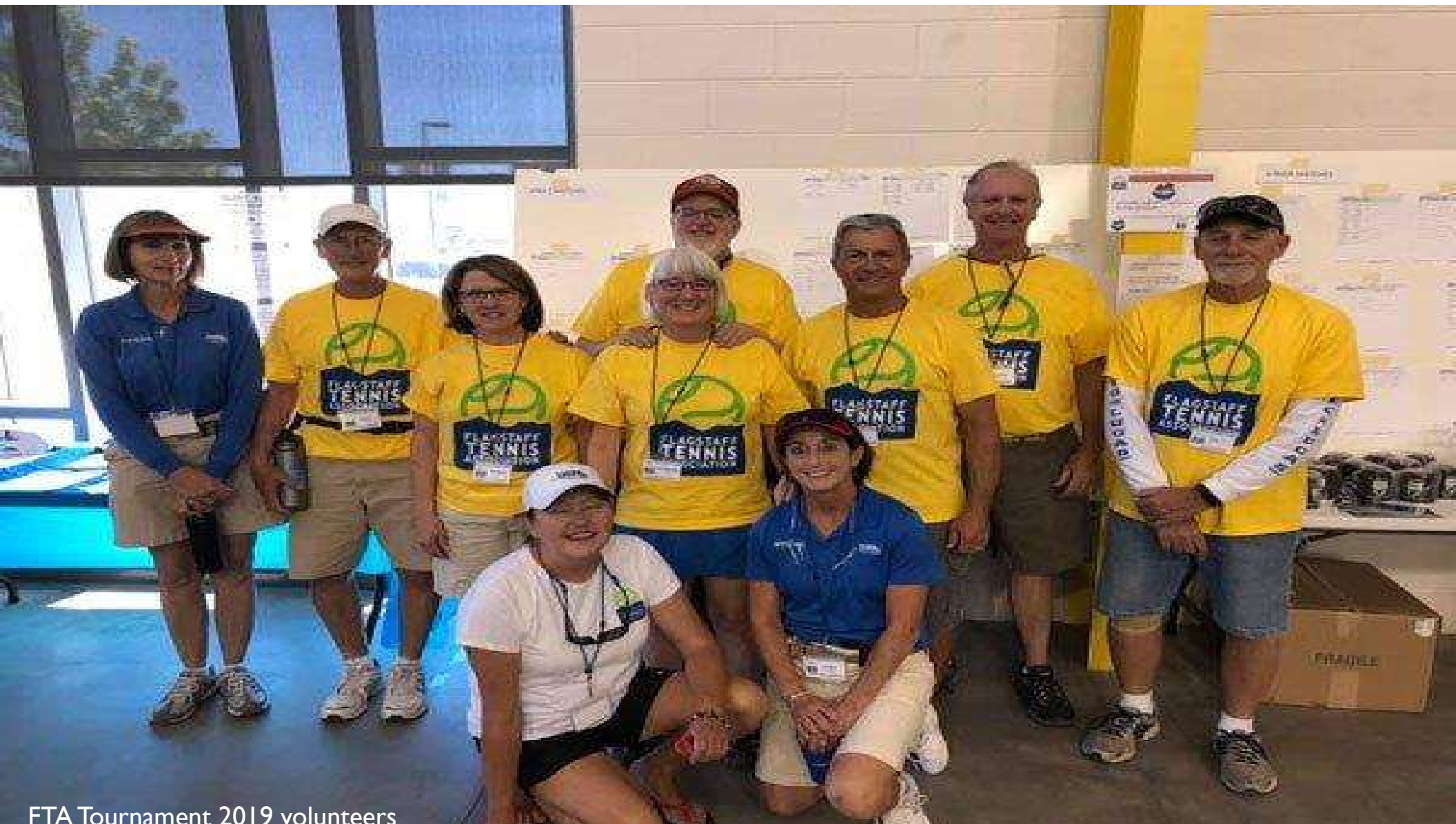
FTA Tournament 2019 volunteers