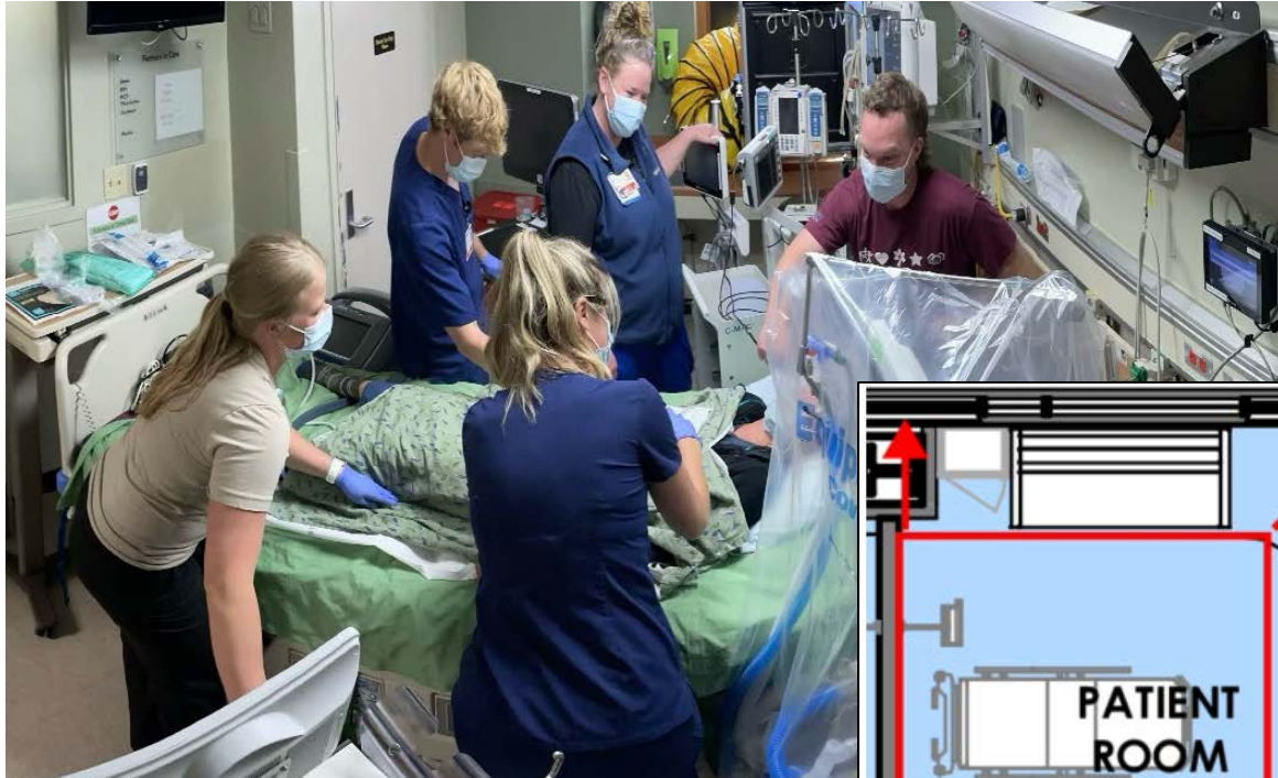
Example of a current FMC ICU Room