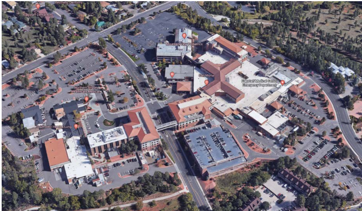
Flagstaff Medical Center – Google Earth View 2022

In the past year, we have had 5,600 deferrals due to unit capacity with 55% of those being from facilities on tribal lands