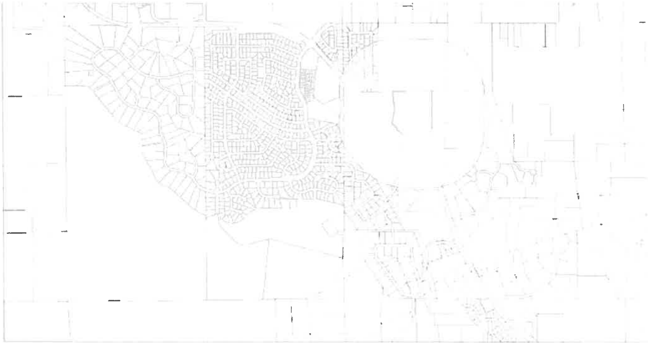
Exhibit A: 1,000' Assessor's Map