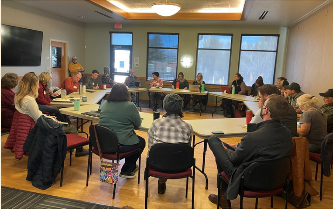
Participants at the Outdoor Educators meeting.

Together with the AZ Trail Association, the Open Spaces section organized and hosted the first northern Arizona Outdoor Educators meeting. For quite a while, who knew that there were many organizations doing outdoor and environmental education with kids, and it was time to get everyone together so that we could meet, learn what each other does, and brainstorm on ways we can partner and collaborate. It was a very productive meeting, with 27 attendees in person! We are working on next steps for this coalition, including working groups. Our next meeting will be Monday June 5, 2023 from 10am-noon.