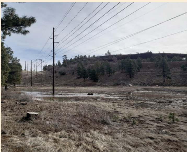
Flooding on the trail to deep water pond.

With the heavy rain we received in early April, the Rio de Flag in Picture Canyon flooded, making it impossible to use the trail toward the Deep Water Pond and the footbridge. It started to recede, but with the abrupt high temperatures, the snow melt increased the flooding even more.