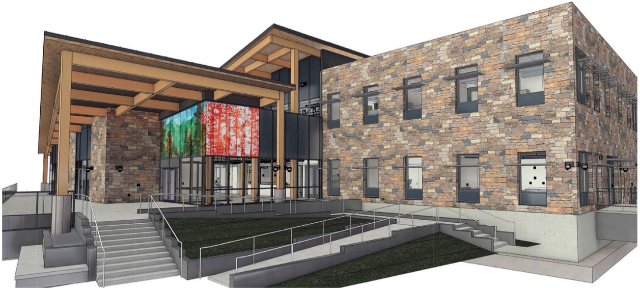
① GLASS ART PERSPECTIVE SCALE: NTS

Art Glass will be integrated into the main entry of the new DCC building. The architect and the artist team worked diligently to align the glass mullions and support features so that the art glass and architectural features are complementarily enhancing each other.