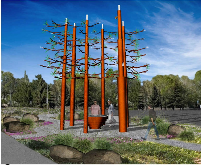
1 GROVE SCULPTURE IMAGE SCALE: NTS