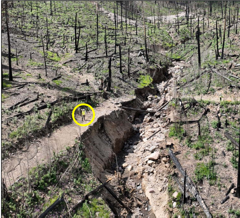
7 September 2022