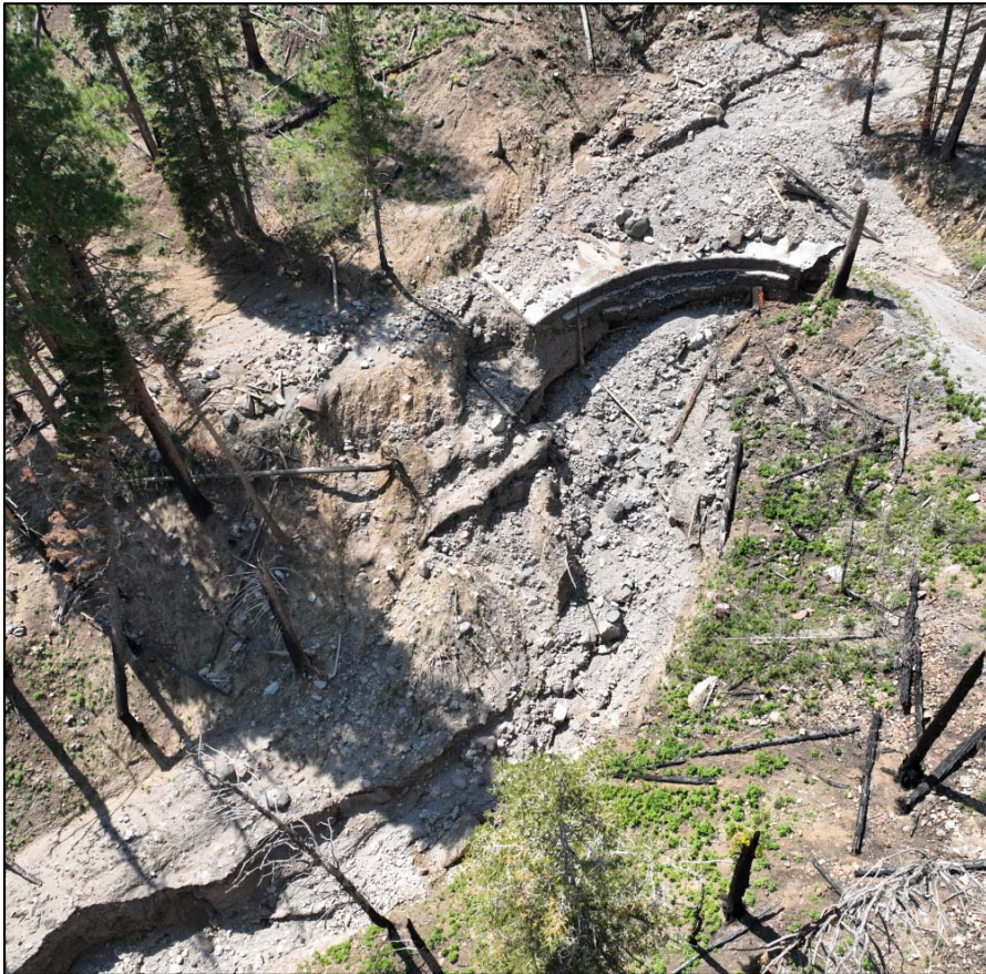
7 September 2022