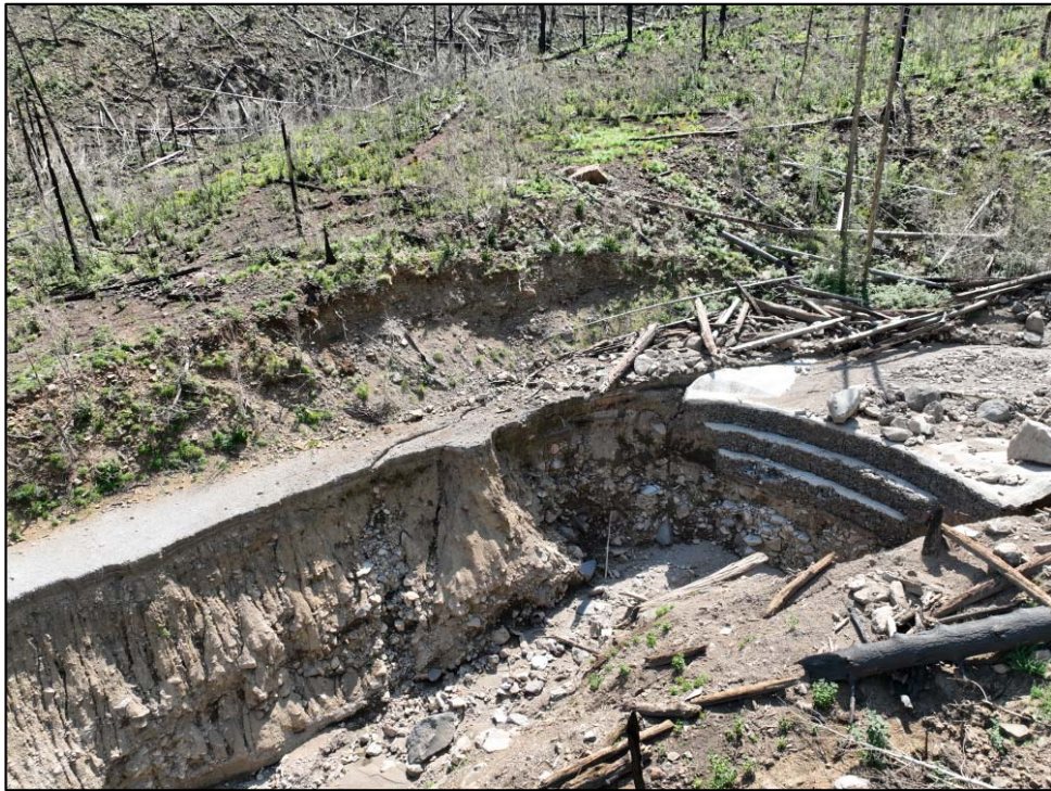
7 September 2022