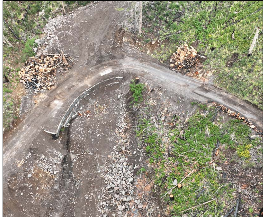
21 August 2023