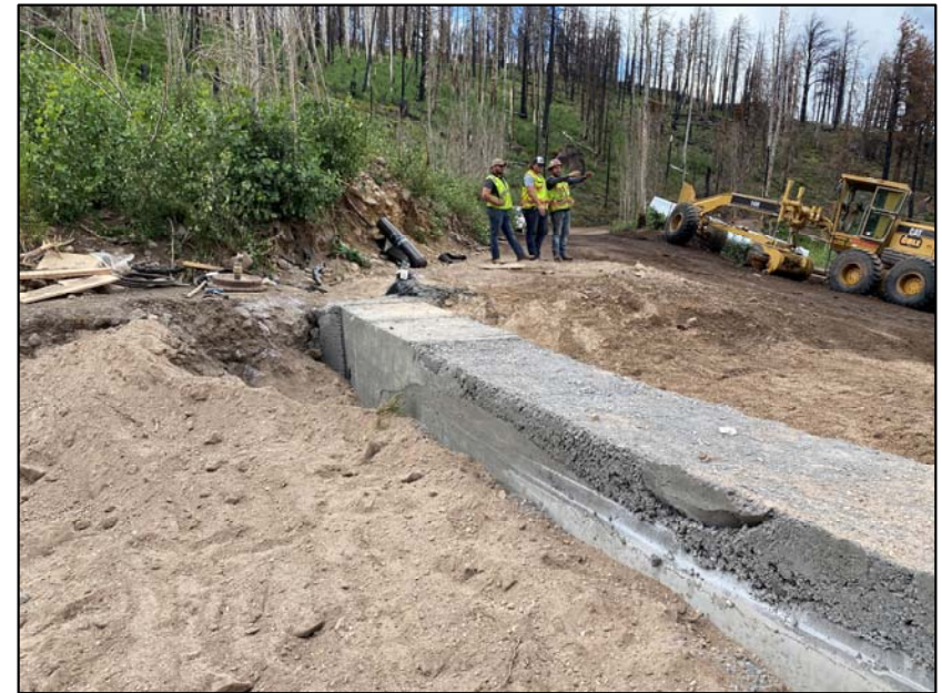
Concrete Encasement – Point I