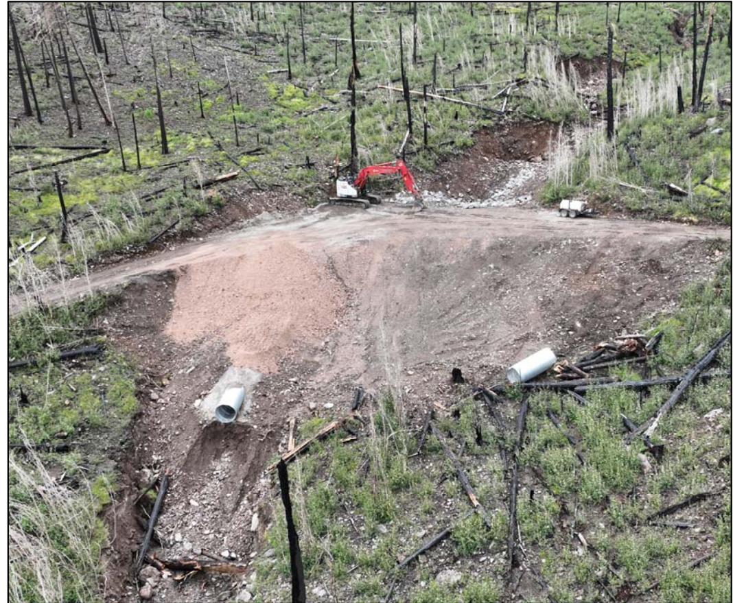
21 August 2023