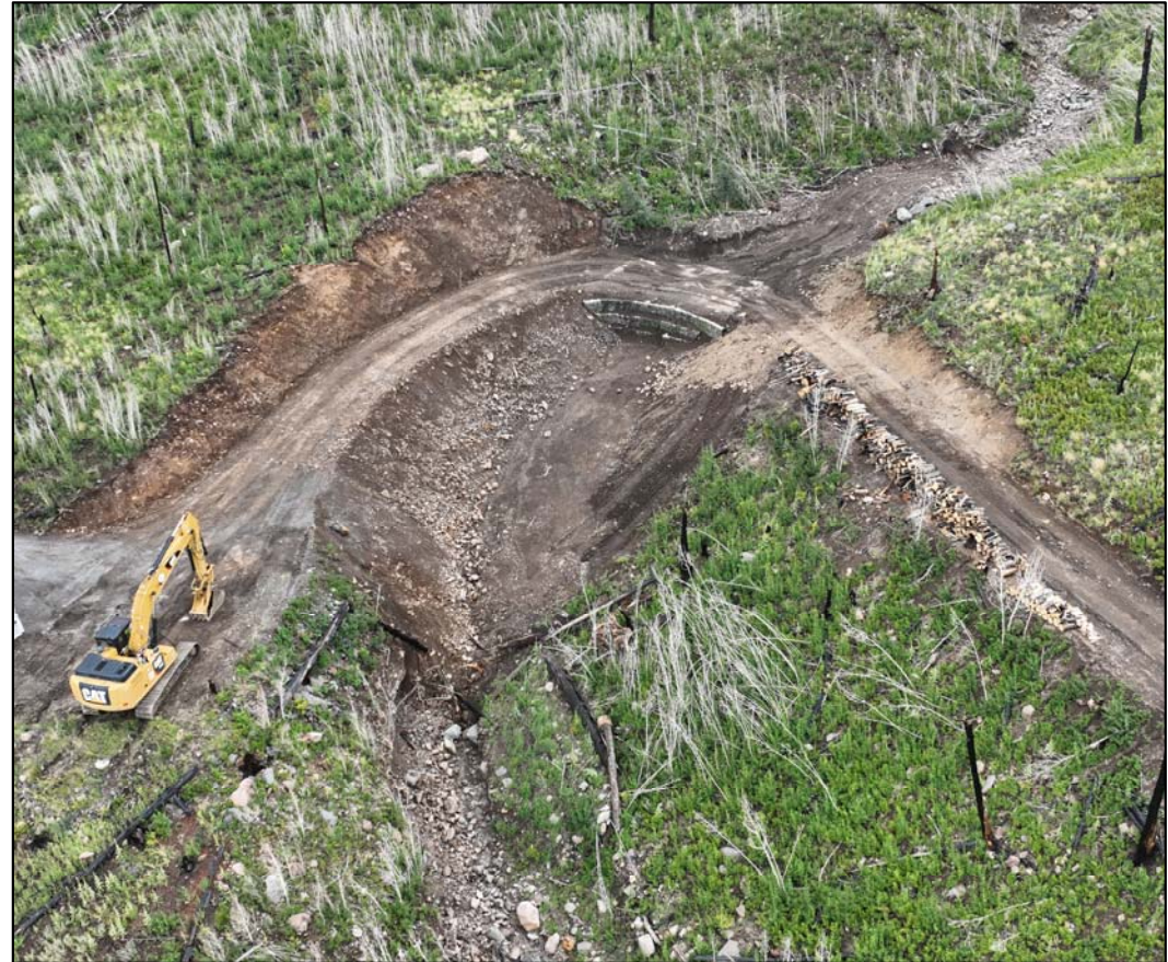
21 August 2023