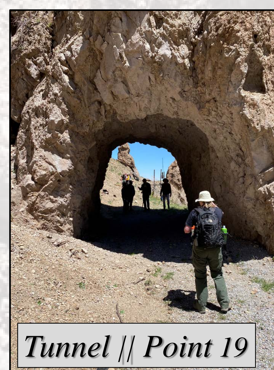
Tunnel // Point 19