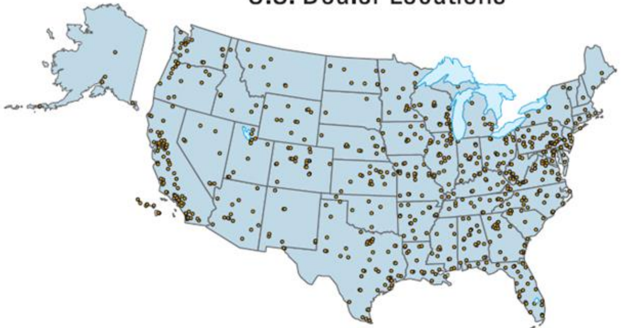
Image: US Dealer Locations