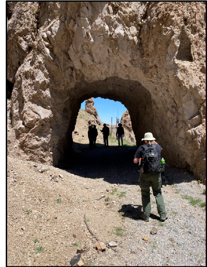
Waterline Road – Tunnel