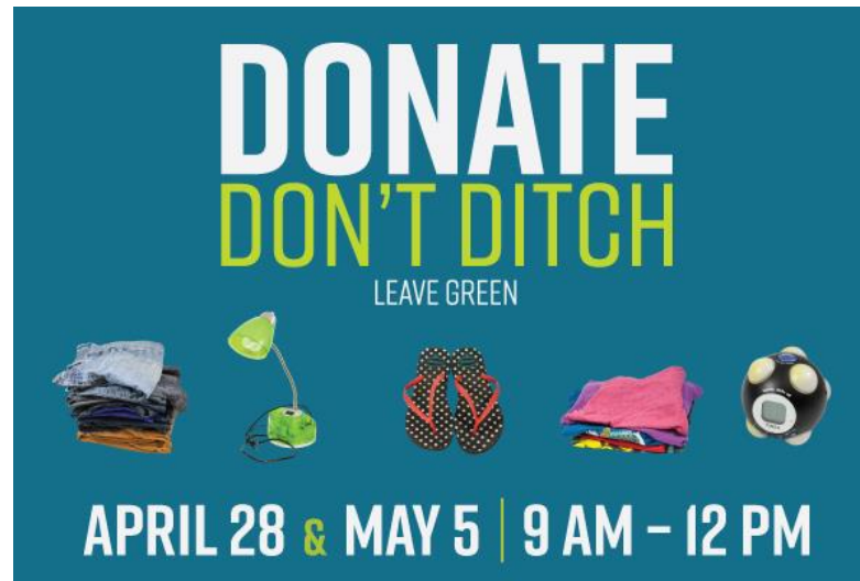
Donate Don't Ditch