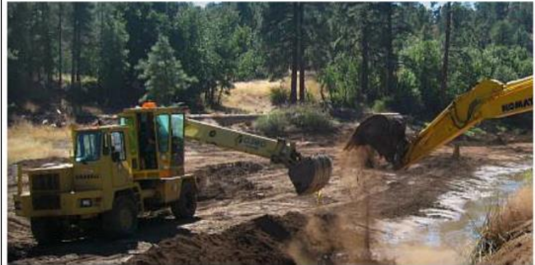
City Of Flagstaff