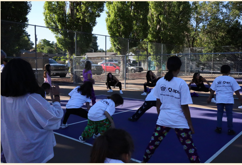
Above: Students participate in warm-up stretches with Phoenix Suns dancers.

The Phoenix Suns and APS hosted a Phoenix Suns Court Take Over and Clinic on Monday, September 25, 2023.