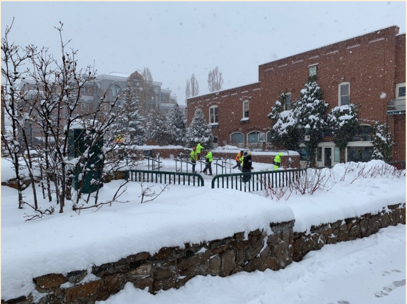
Above: Parks crew performing snow operations in Heritage Square.

Hard to believe that winter is here, but here we stand ready to move some snow! The efforts to keep the sidewalks, commuter trails of the FUTS, recreation center entrances, parking lots of many city buildings and civic spaces clear of snow is quite the operation, and all of PROSE is ready to react. The snow season outlook is predicted to be normal to higher than normal precipitation with the potential of a Flagstaff special large accumulation snowstorm.