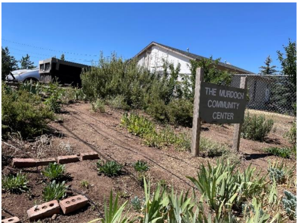
Photo Below: Murdoch Butterfly Garden Drip Irrigation system installed by Girl Scout Troop 6520 volunteers and Sustainability staff on July 15 th .