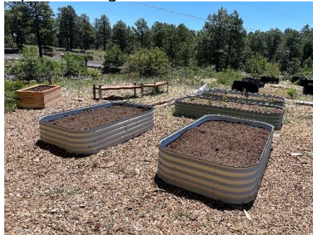
Photo Above: The two new raised garden beds and donated cedar box for the new pollinator garden space at Southside Community Garden.