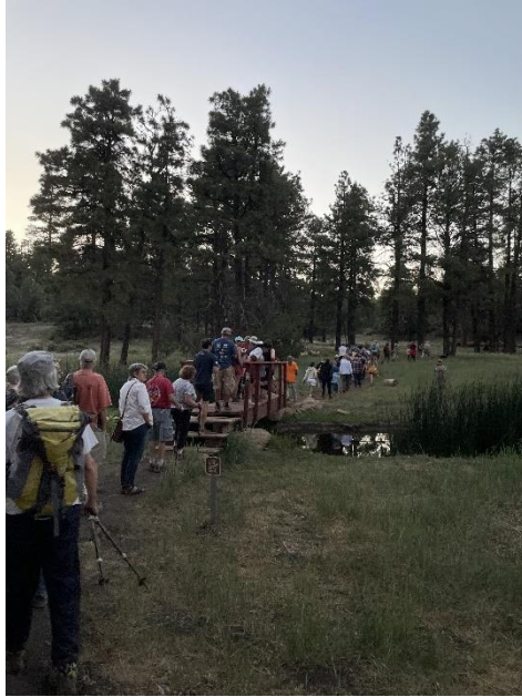
Photo Above: Community members hiking across the bridge at Picture Canyon at twilight in search of nocturnal pollinators.