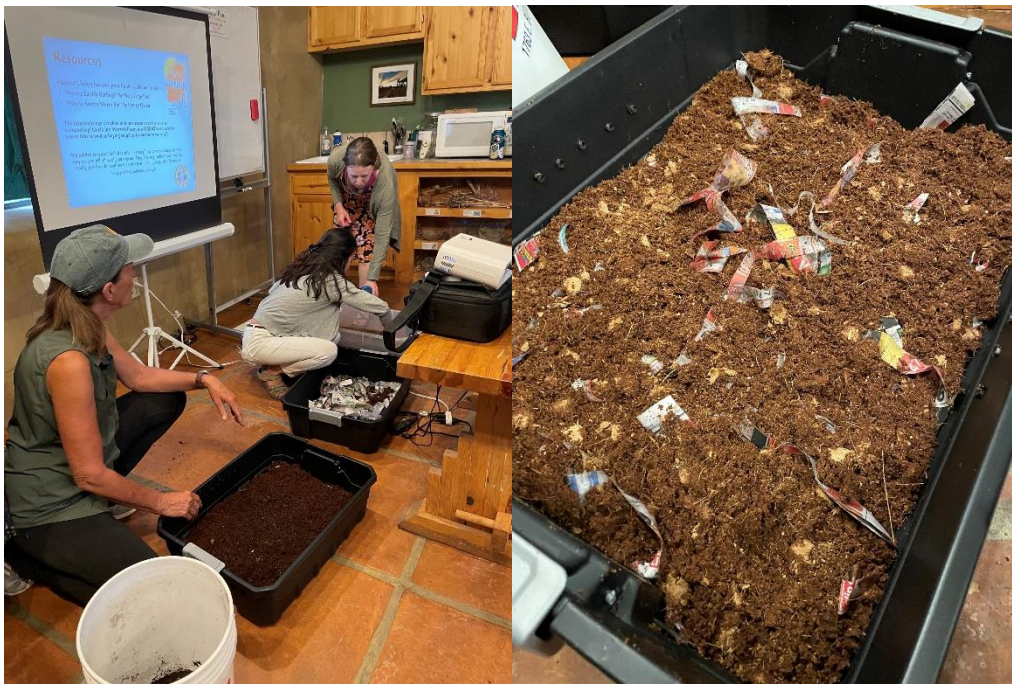
Photos Above Left: Community members filling vermicomposting bins. Right: A completed vermicomposting bin.