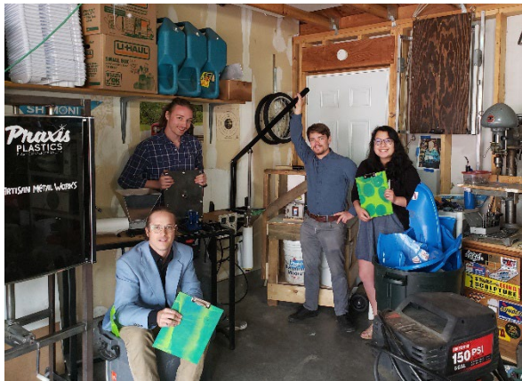
Precious Plastics Sled Recycling Program