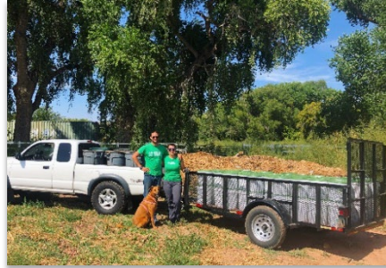
Compost Crowd Trailer