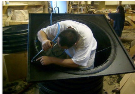
AZ Custom Plastics Expanding Local Plastic Recycling

On behalf of the City of Flagstaff Sustainability Commission and Sustainability Office