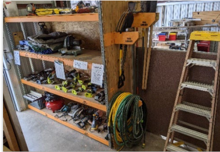
Flagstaff Maker Space Shared Tool Library