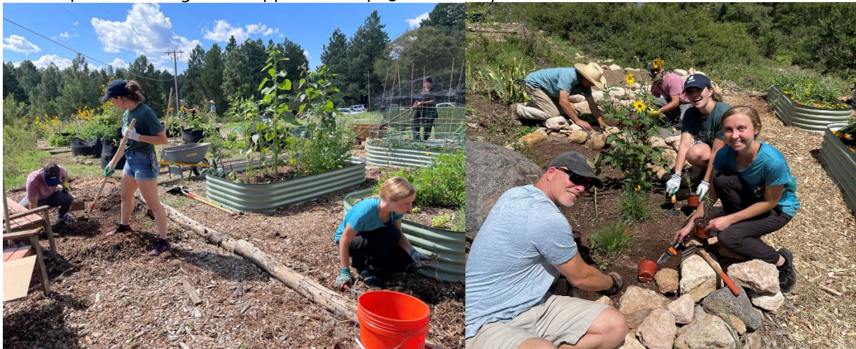
Above Photos: Volunteers re-mulch pathways and plant pollinator-friendly plants at the Southside Community Garden on August 26 th .