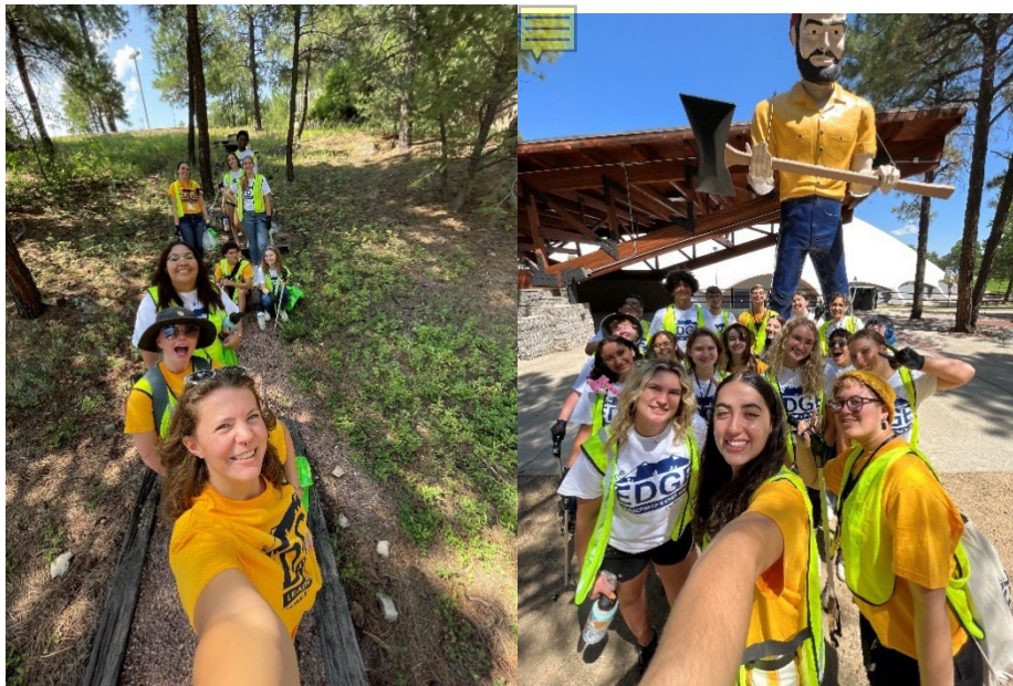
Photos Above: NAU students conducting a litter clean-up as part of the NAU EDGE Leadership program.