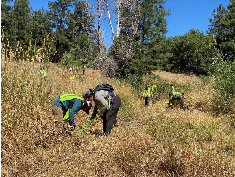
Photo Above: Volunteers clear grass and woody debris from the Rio De Flag channel at the August 3 rd watershed cleanup