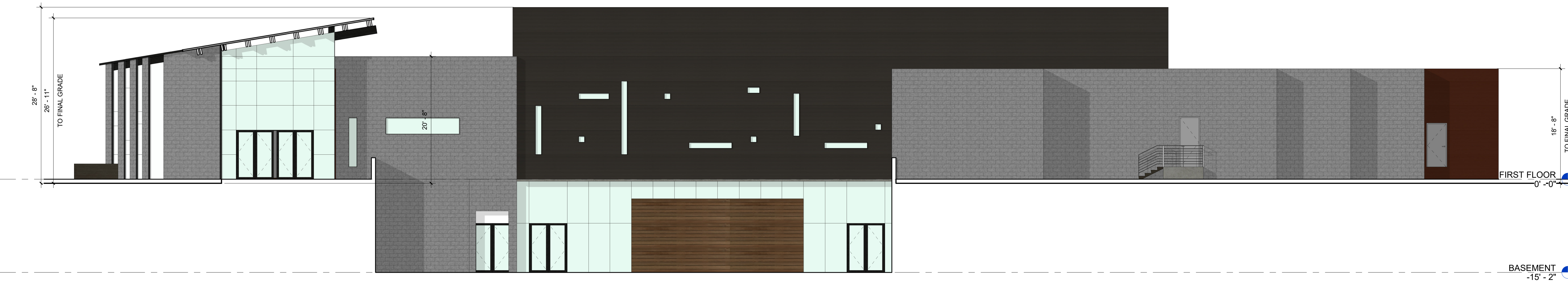
2 SOUTH 1/8" = 1'-0"