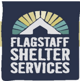
EXHIBIT A SCOPE OF WORK