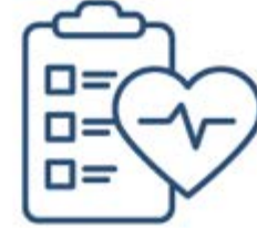
Biomedical / Health Care