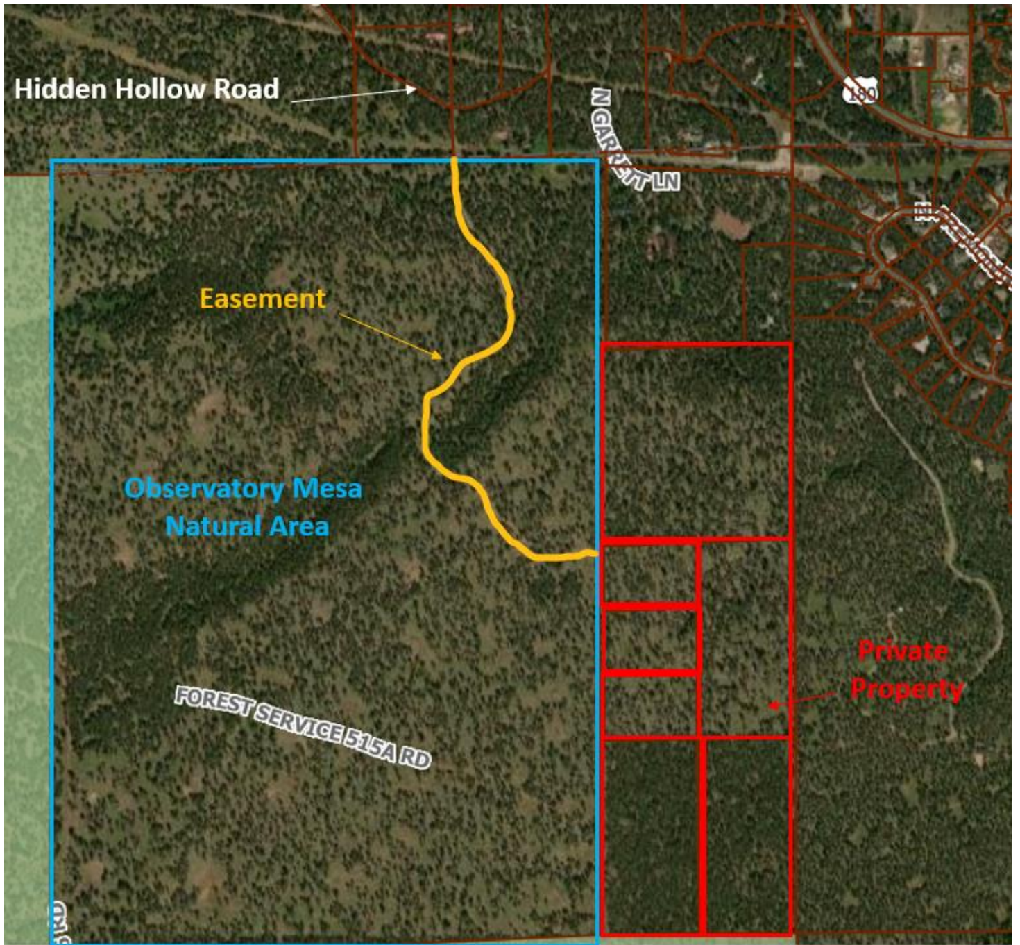
Map 3: Private Properties and Access Road