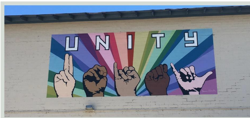
Beautification in Action: UNITY by Karen Fiorito