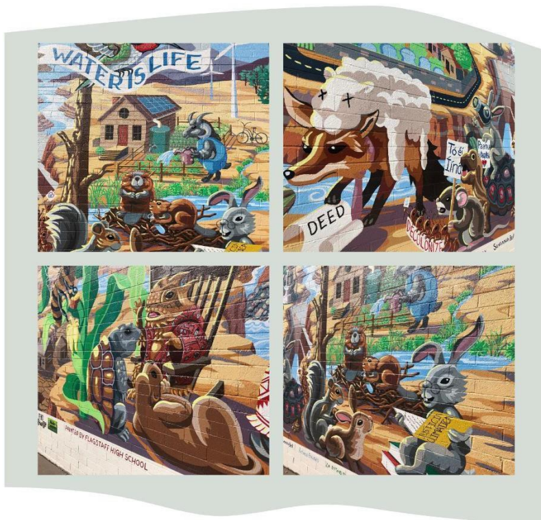
Beautification in Action: Water Justice Mural by Mural Mice Universal and Flagstaff High School Students