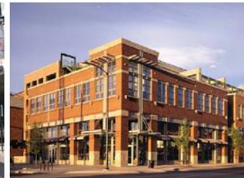
Parking areas should be screened from public view. When facing a public street, design the edges with active building uses, when feasible, or design to look like a building with similar bay rhythm and materiality. When facing an alley, use creative screening techniques, such as mesh, screens, green walls, or design to look like a building.