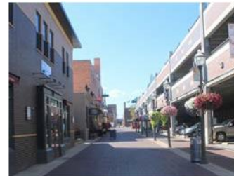
A pedestrian alley in Rapid City, SD that is similar to the concept shown, with parking structure on one side (with flat floors and high ceilings for future adaptive reuse) and businesses activating the other side. Ample pedestrian-scaled lighting, flowers, and other amenities keep the space looking nice and feeling safe.

The diagram above shows how site circulation to parking could work. All entries/exits would be right in, right out due to Aspen being a one-way street and Route 66 and Humphreys being busy streets. This concept envisions a pedestrian-only alley for a half-block at Beaver Street with a safe mid-block pedestrian crossing to allow pedestrians a safe and interesting walk that connects to the downtown core and activated alleys.