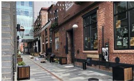
The Dairy Block in Denver, CO is a public amenity with art, games, lighting, and seating areas. A boutique hotel and lobby bar is one use that activates the space.

This concept shows the entire block redeveloping into a mixed use gateway to downtown. This catalyst project envisions a public-private partnership to redevelop into a mixed use block with a public-parking component. The program is to be determined, but any project on this site should give back to the community with public parking and public space. This location would also be ideal to contribute downtown housing and a small grocery/market.