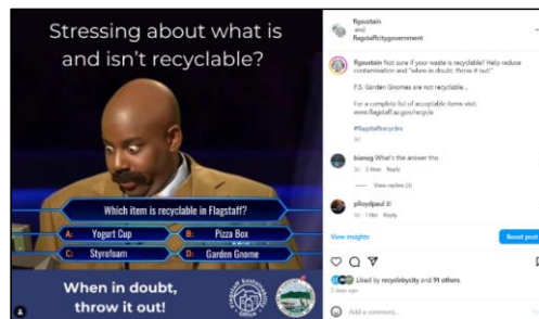
Photo: Our top Instagram and Facebook post in February about "Stressing about what is and isn't recyclable?" The Instagram post received 92 likes and engaged 117 users, and the Facebook post received 26 reactions and engaged 93 users.