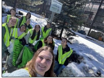
Photo: The NAU Disney Club at their February Adopt-an-Avenue cleanup.