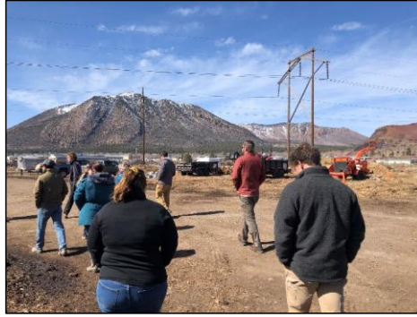
Photos: City staff touring the Restoration Soils composting facility on February 23rd.