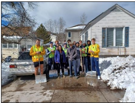
Photos: (Left Above) Members of the NAU football team assist a resident by cleaning their sidewalk of snow through the Snow Heroes program. (Right) The AZ Daily Sun highlighted the program both in print and online in February.