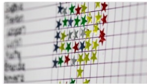
Recognize a Coworker (On the Spot)