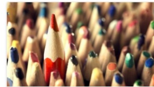
Human Resources Benefits & Leaves