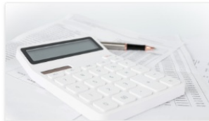
Paystub and Time-Off Accrual