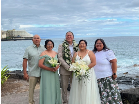
Clockwise from top left: Family trip to Chicago, Showing her Lumberjack Pride with her daughters, and Family wedding in Hawai'i