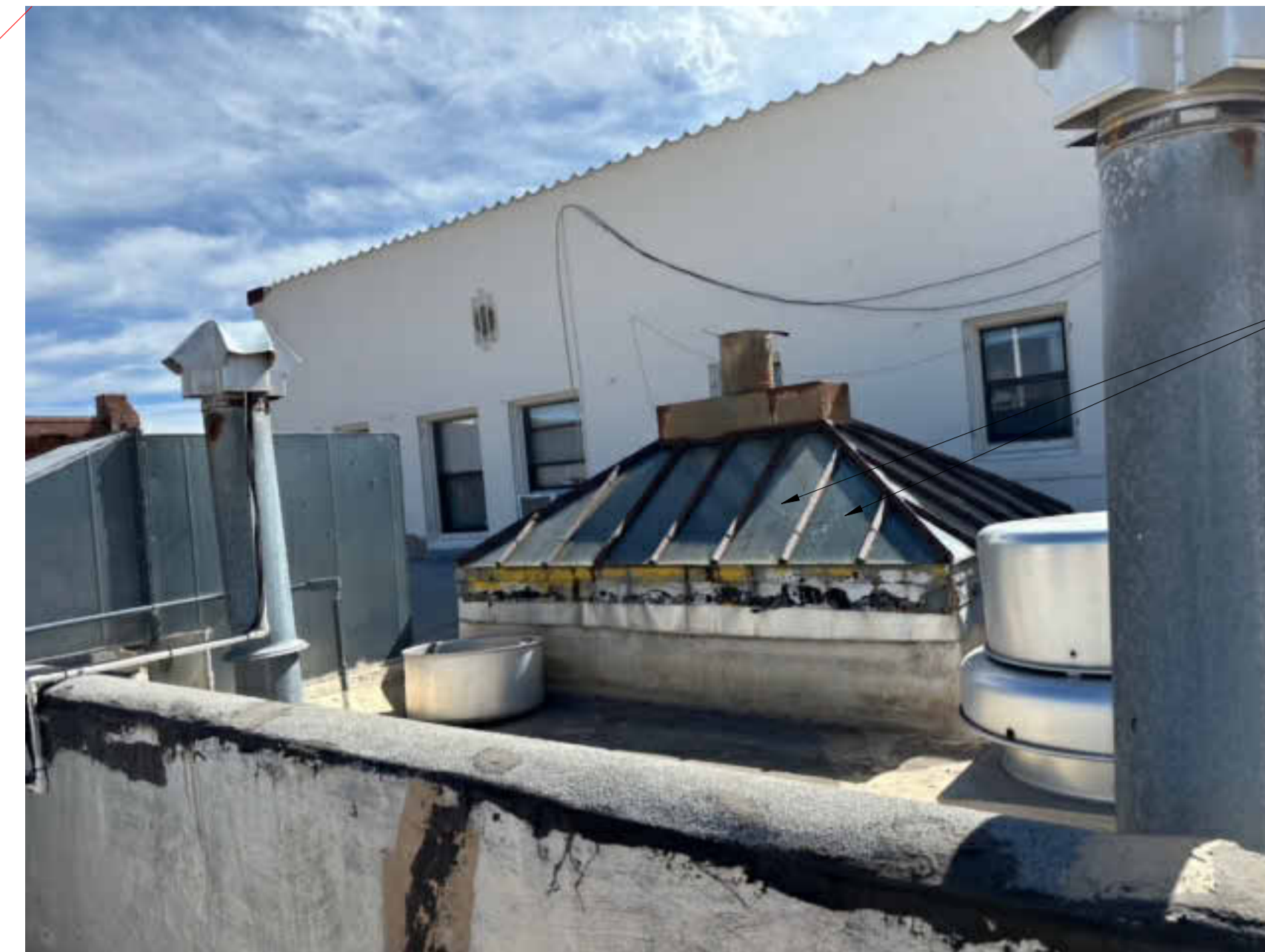
EXISTING GLAZING TO BE REPLACED - TYPICAL