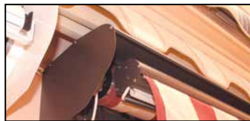
Standard unit with optional drop valance - front rail style.