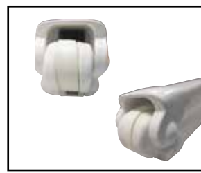
New belt arms for lasting performance