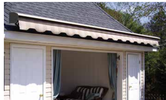
Roof mount - fully retracted

Superb durability and maintenance-free operation, Elite Plus offers the finest component features available in the industry.