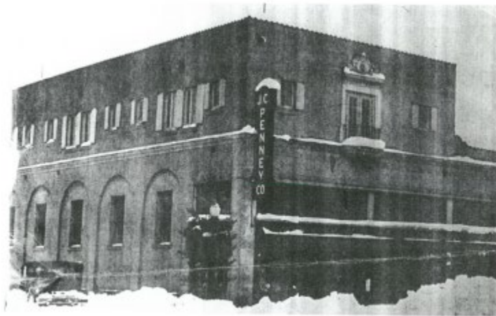
3 of 5. Late 1920s photo of the JC Penney building from the SE