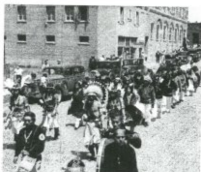
5 of 5. Photograph from Coconino Sun of Indian Pow Wow parade on Aspen Ave. Taken from SW. Photographer stood in front of the Orpheum.