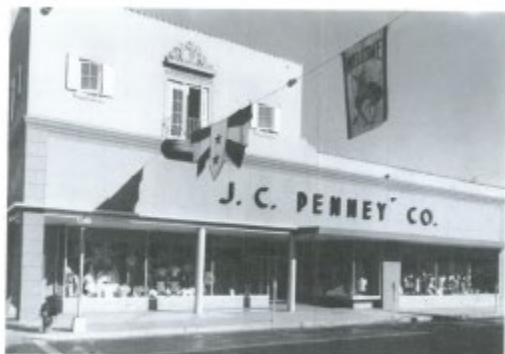
4 of 5. Early 1960s photo of the JC Penney building from the SE