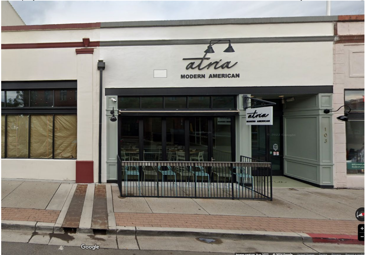
2 of 5. Google Street View of 103 N Leroux from the E