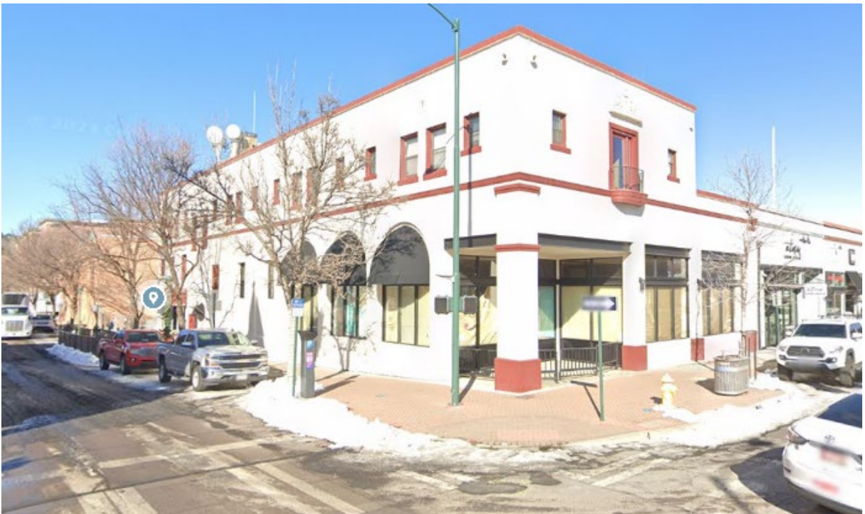
1 of 5. Google Street View of 101 N Leroux from the SE

Description of Photograph(s) and number, include description of view indicating direction of camera: