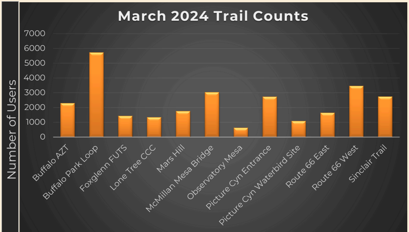
Above: Trail Count graph

Spring is here, and the Parks turf maintenance operation is in full swing!