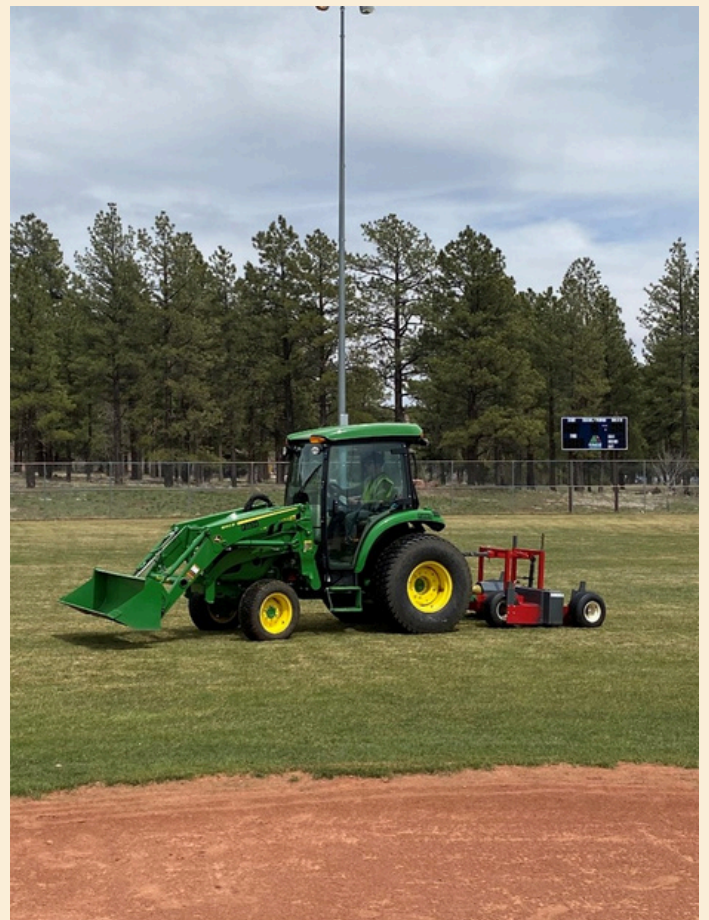
Right: Staff performing turf maintenance

This team is responsible for turf maintenance operations throughout all parks. Staff responsibilities include dethatching, aeration, fertilization, overseeding, and topdressing of turf, as well as weekly mowing of all athletic fields. These efforts enable us to provide exceptional grassy play areas to all park and athletic group users.