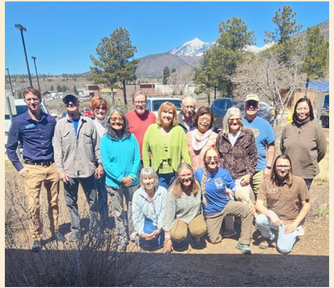
Above: volunteer appreciation group photo

Open Space held a volunteer appreciation event on April 10, 2024. The dedication and commitment of these volunteers is truly remarkable and deserving of recognition. Their tireless efforts have created a meaningful on-site presence across Open Space properties and play a crucial role in promoting ethical use through education. So far in FY 2023-2024 volunteers have donated 1,400 hours, demonstrating their unwavering passion for conservation and community stewardship. Their dedication is the cornerstone of our success, and we extend our heartfelt appreciation for their ongoing support.