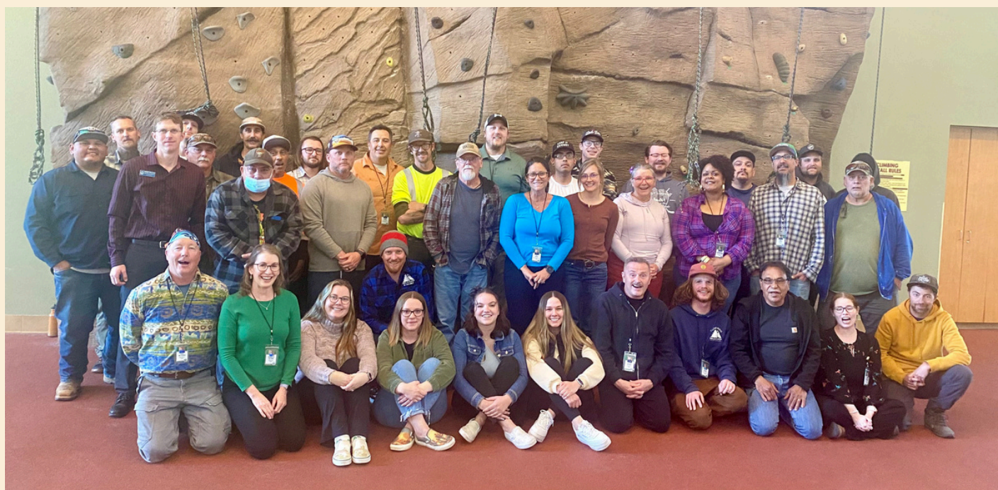
Above: Staff attending mission/vision/values training