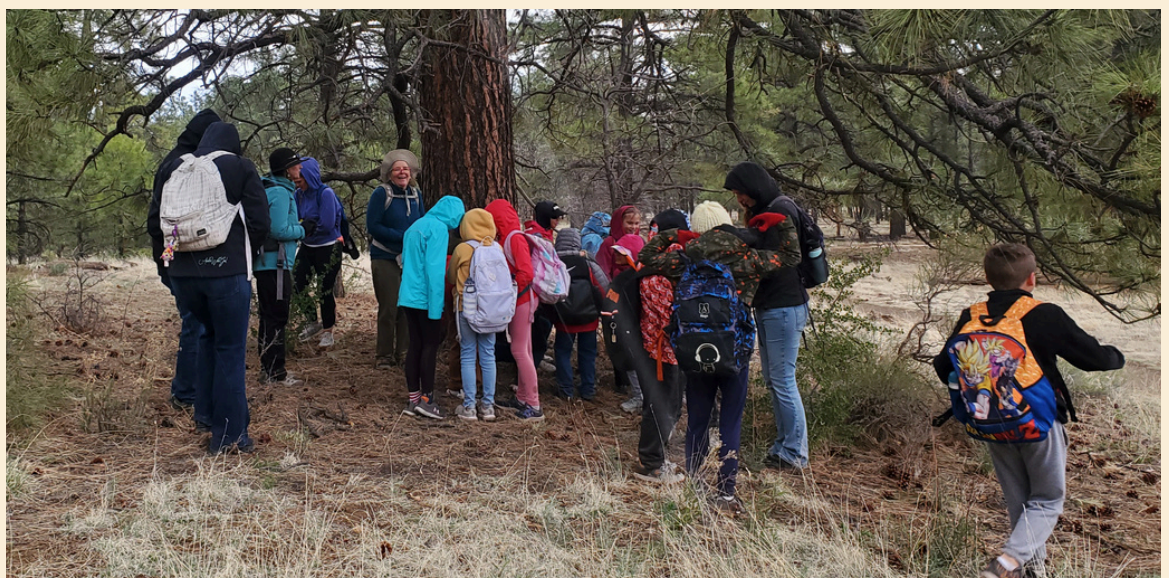
Right: students on a field trip at Picture Canyon