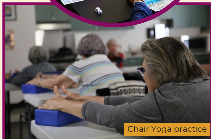
Chair Yoga practice