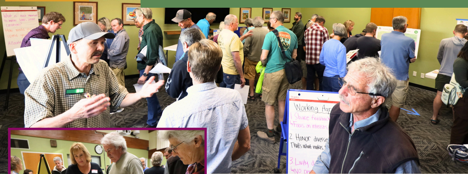
The Observatory Mesa Trail Plan Public Meeting

Connecting our community through people, parks, natural areas, and programs.