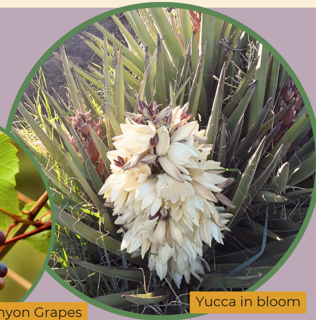
Yucca in bloom