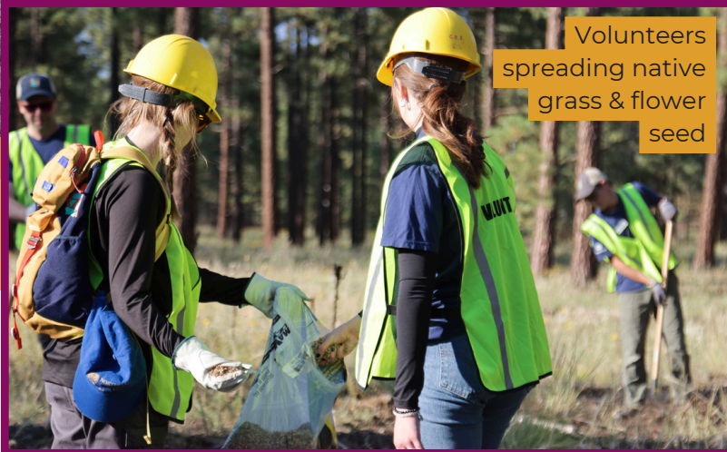
Volunteers spreading native grass & flower seed