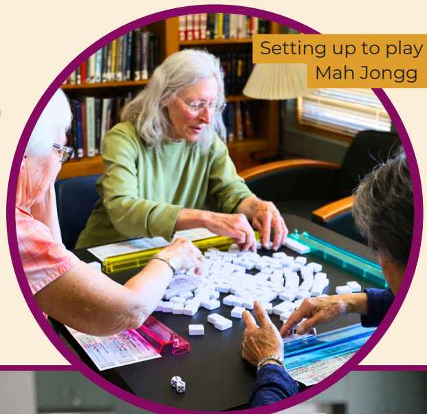
Setting up to play Mah Jongg