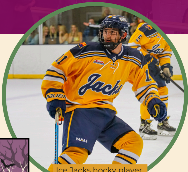
Ice Jacks hockey player

With the hockey season beginning and Adult Winter Hockey League almost upon us, the facility is open from 5:00AM to midnight on most days.