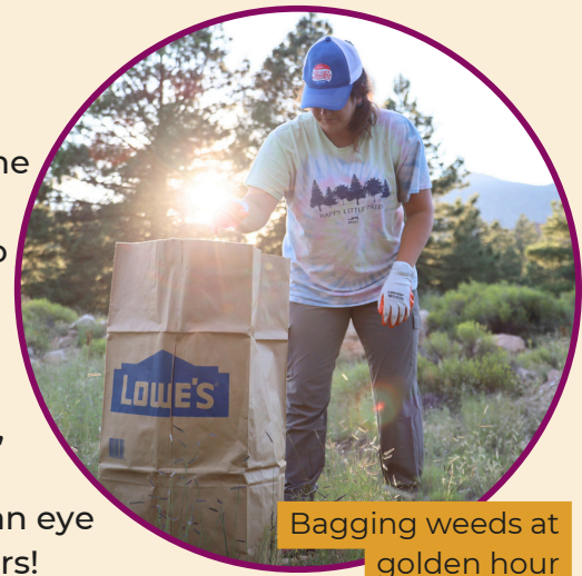
Bagging weeds at golden hour

Open Space hosted over twenty-five weed pull events throughout the summer in which volunteers worked to remove invasive plants from Open Space and other City properties. These events not only work to improve ecosystem health by removing invasive weeds so native plants can thrive but also offer a way for people to connect. The people that volunteer their time to pull weeds in public spaces are full of passion for the natural world or maybe just bored... either way, these events are a great way to spend time outdoors, partake in interesting conversation and complete some satisfying work. Keep an eye out for next season's events and join this community of weed warriors!