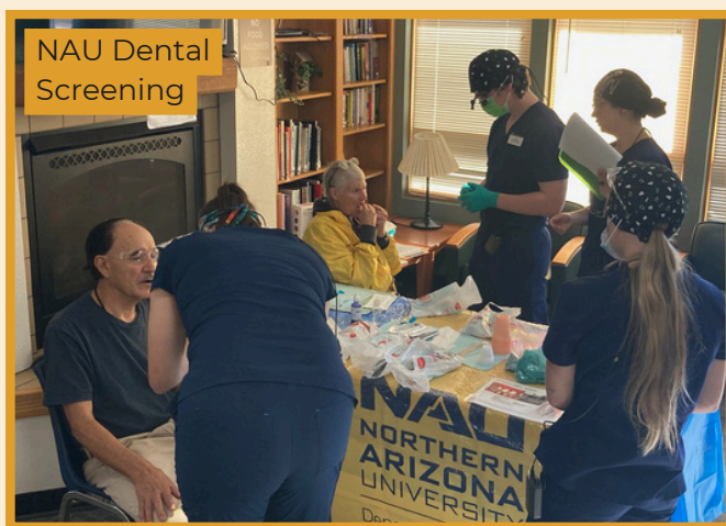
NAU Dental Screening