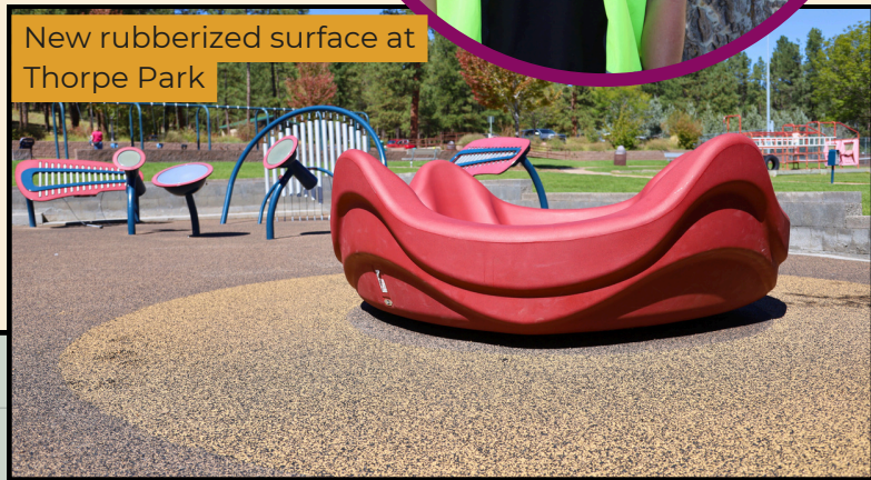
New rubberized surface at Thorpe Park

Bushmaster, Guadalupe and Thorpe Park were temporarily closed for maintenance and repairs. Parks repaired the pour-in-place rubberized playground surfacing and applied a preventative maintenance flex-coat that will protect against weathering. The playgrounds are open again and fully functioning.