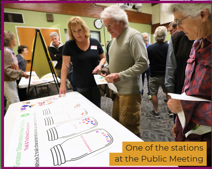
One of the stations at the Public Meeting