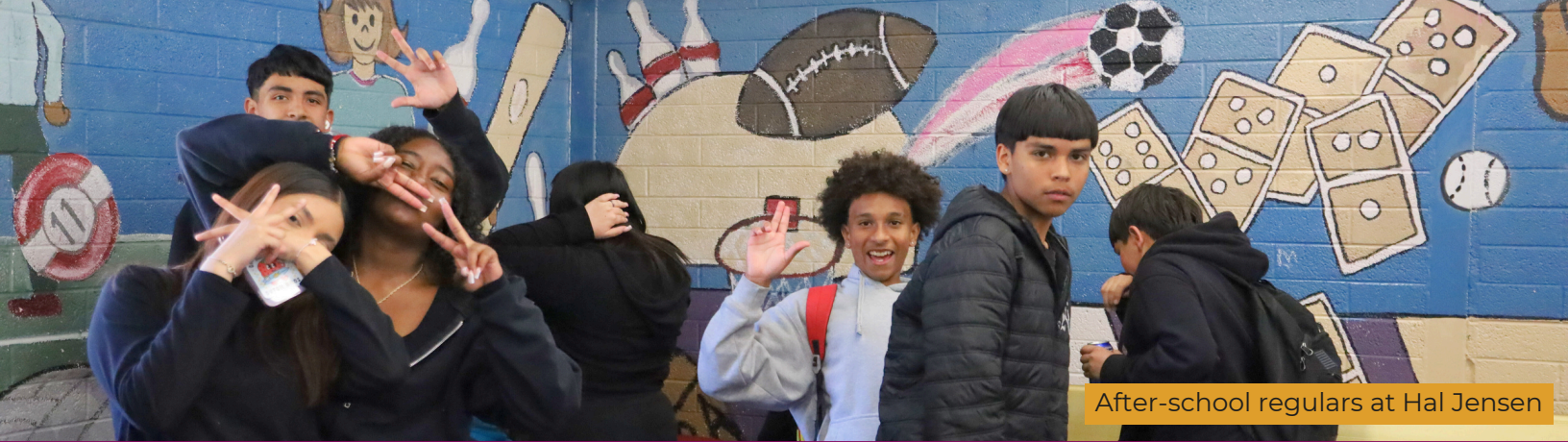
After-school regulars at Hal Jensen