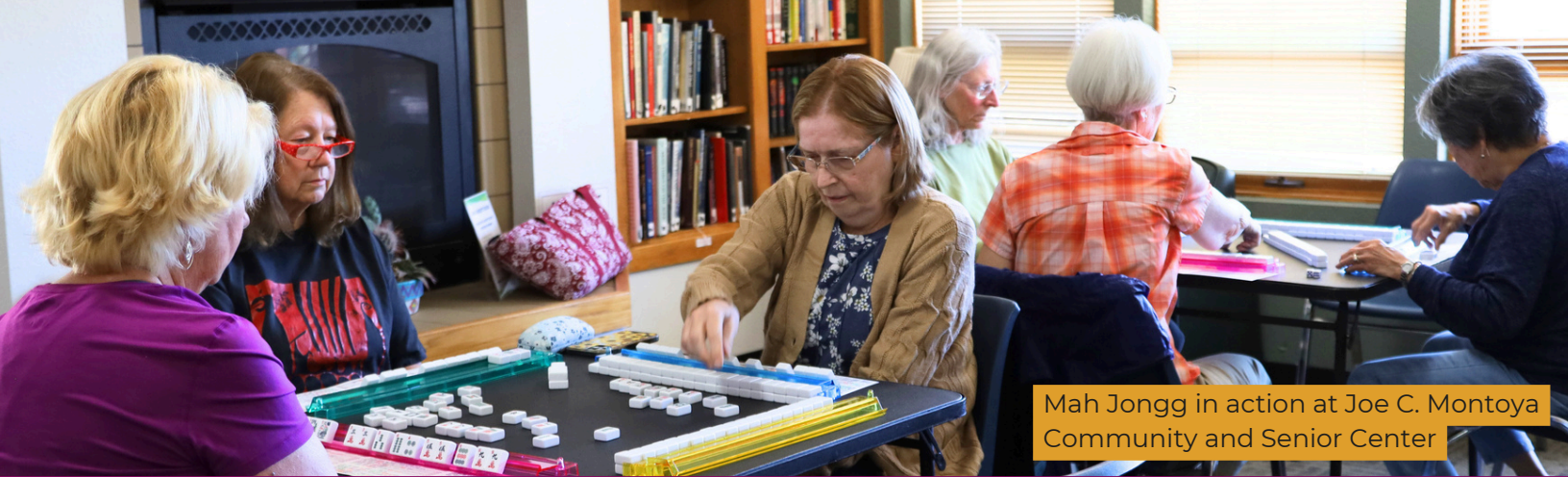
Mah Jongg in action at Joe C. Montoya Community and Senior Center