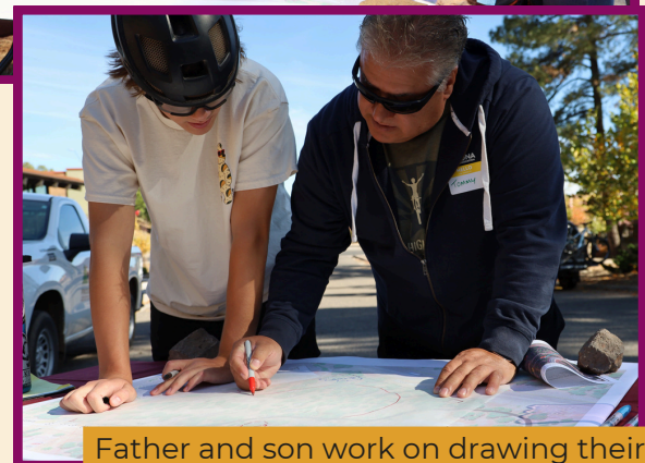
Father and son work on drawing their preferred park layout