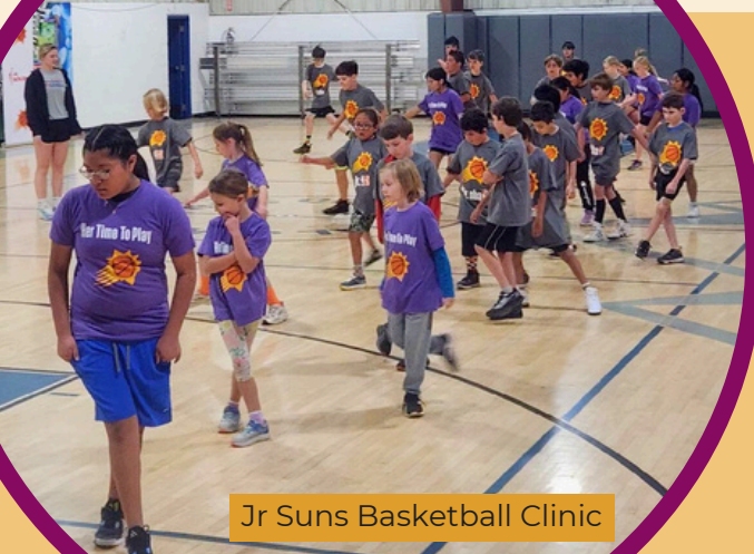
Jr Suns Basketball Clinic