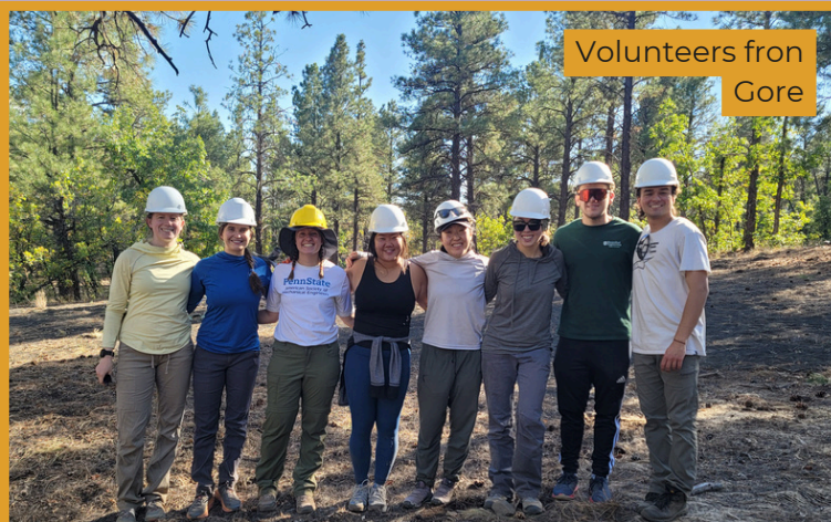
Volunteers from Gore