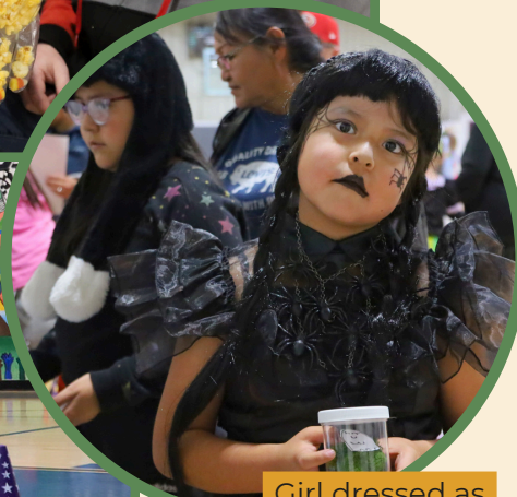
Girl dressed as Wednesday with her 'ghost in a jar' craft and fully committed to the character