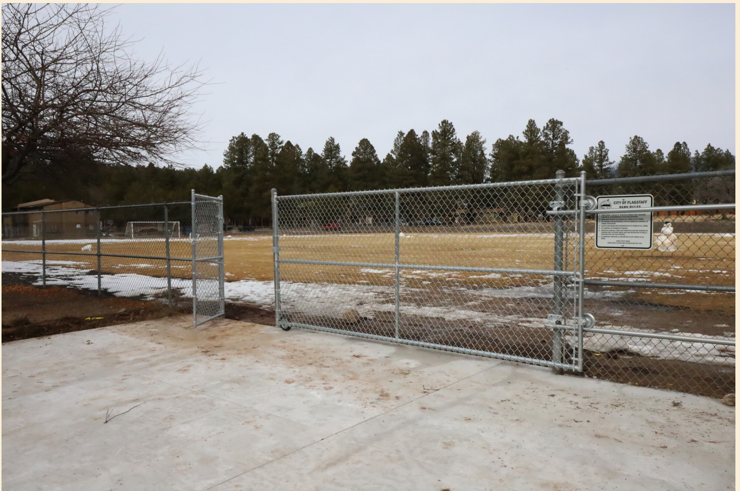
Above: Thorpe Park Multi Purpose gate

The Parks Section has been fitting in between snow operations this winter season on an improvement at the Thorpe Park Multi-Purpose fields adjacent to Clark Homes. The improvements include corrections to the access points to the turf field as well as gate improvements. The improvements are a direct result of speaking with our athletic user groups that receive permits on the field plus creating correct access for all in our community.