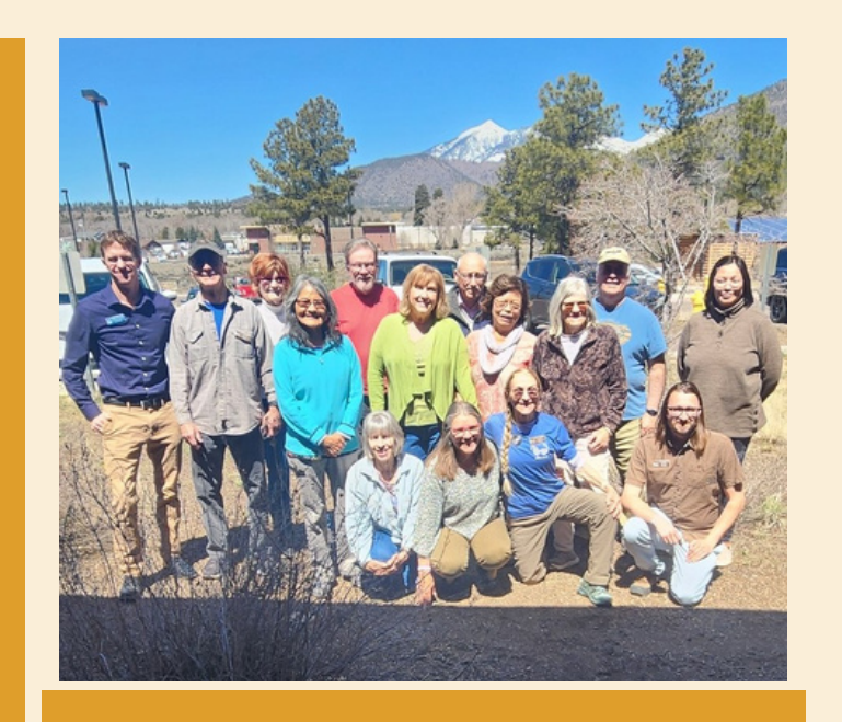
Above: volunteer appreciation group photo

Open Space held a volunteer appreciation event on April 10, 2024. The dedication and commitment of these volunteers is truly remarkable and deserving of recognition. Their tireless efforts have created a meaningful on-site presence across Open Space properties and play a crucial role in promoting ethical use through education. So far in FY 2023-2024 volunteers have donated 1,400 hours, demonstrating their unwavering passion for conservation and community stewardship. Their dedication is the cornerstone of our success, and we extend our heartfelt appreciation for their ongoing support.