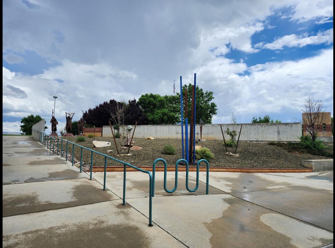
Installation at Prescott Valley Civic Center