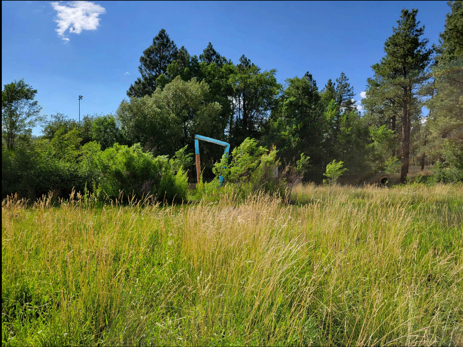
View from pond inner loop