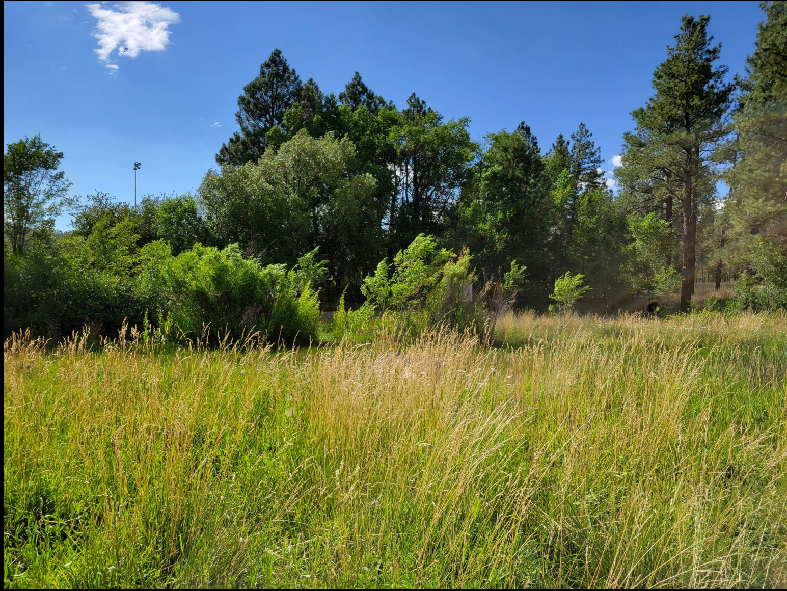
View from pond inner loop