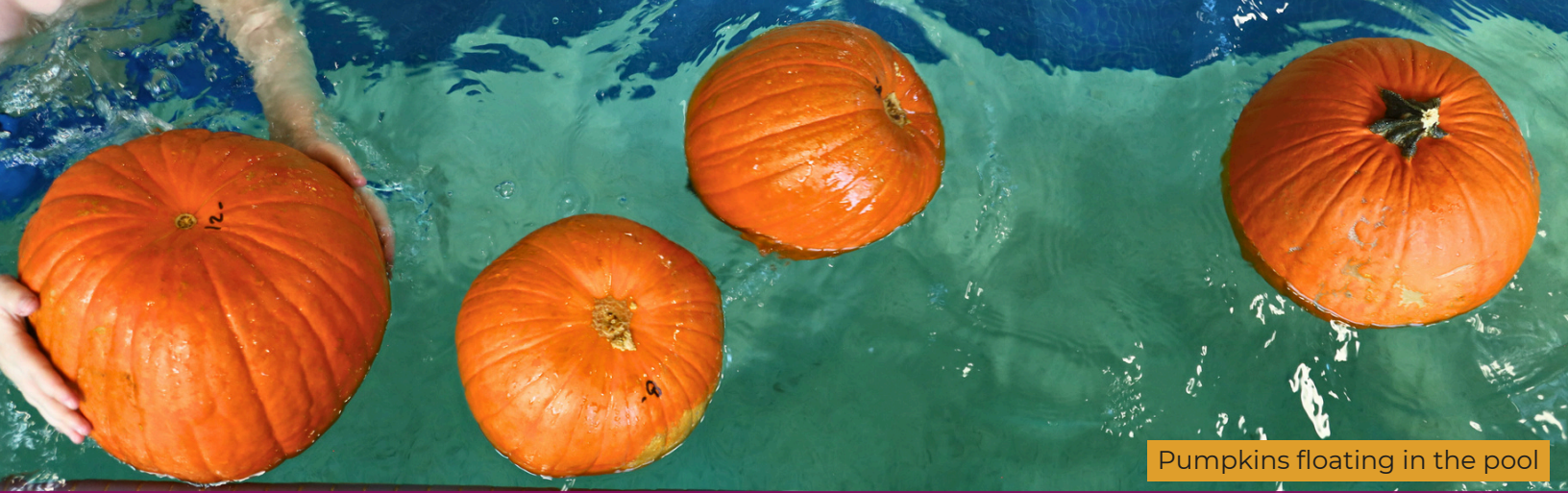
Pumpkins floating in the pool