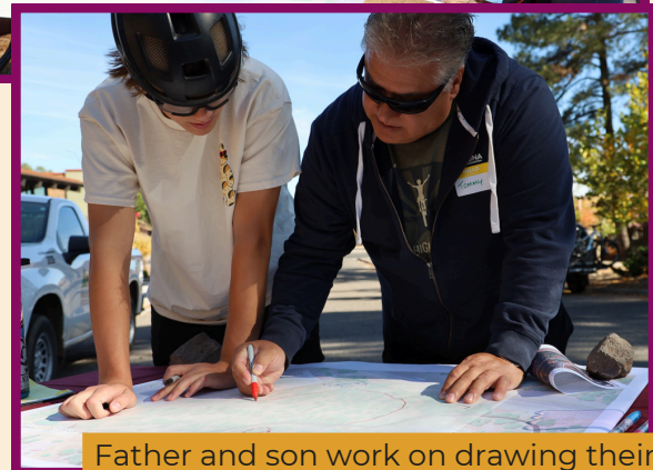
Father and son work on drawing their preferred park layout