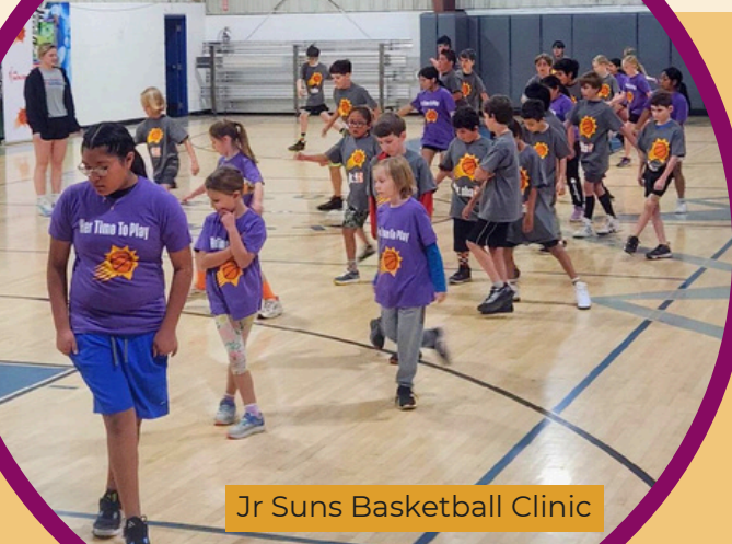
Jr Suns Basketball Clinic