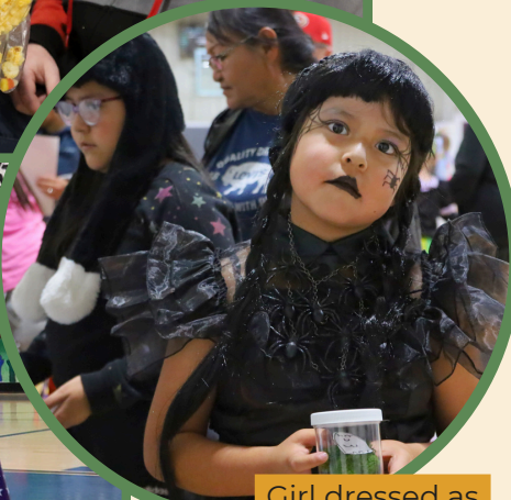
Girl dressed as Wednesday with her 'ghost in a jar' craft and fully committed to the character