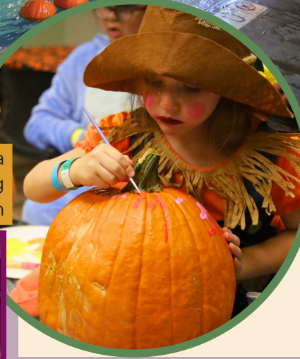
Girl dressed as a scarecrow painting her pumpkin

The Aquaplex hosted a new Halloween event this year called the Pumpkin Plunge with over two-hundred participants. The event offered the opportunity to swim in the pool amongst floating pumpkins and pick a favorite one to decorate or take home and carve. Both adults and kids enjoyed this unique twist on the pumpkin patch experience. Thank you to Viola's for discounting these pumpkins to make this an affordable event for the community.