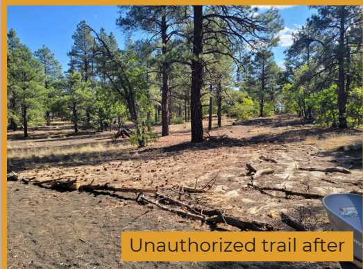
Unauthorized trail after