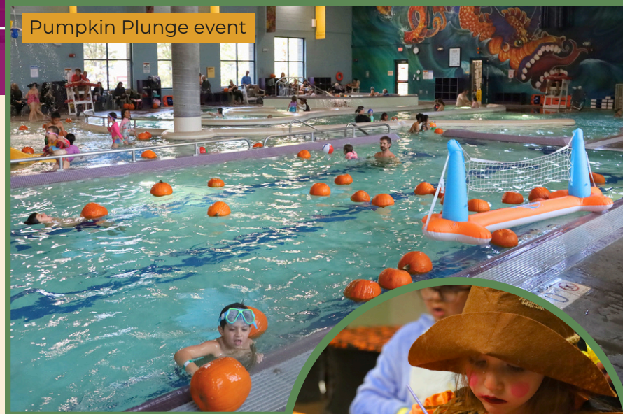
Pumpkin Plunge event