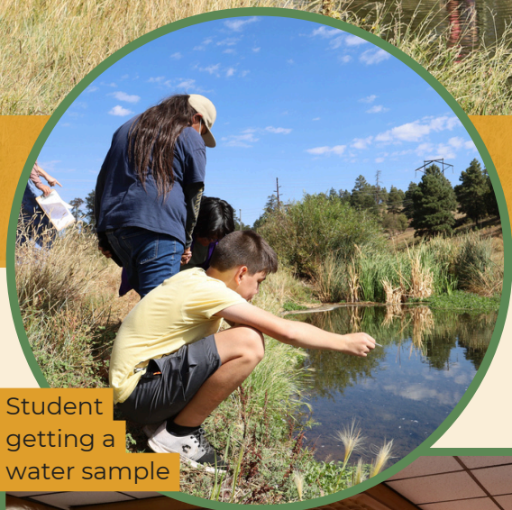
Student getting a water sample