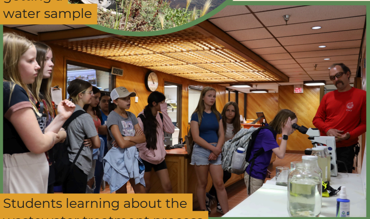
Students learning about the wastewater treatment process