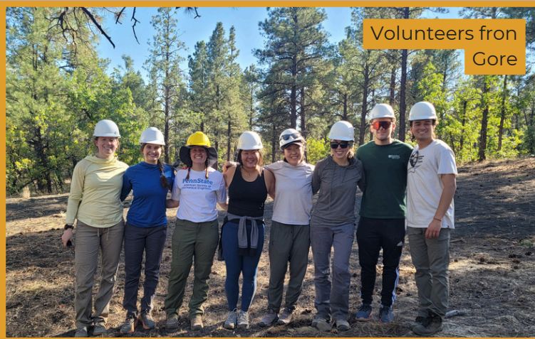
Volunteers from Gore