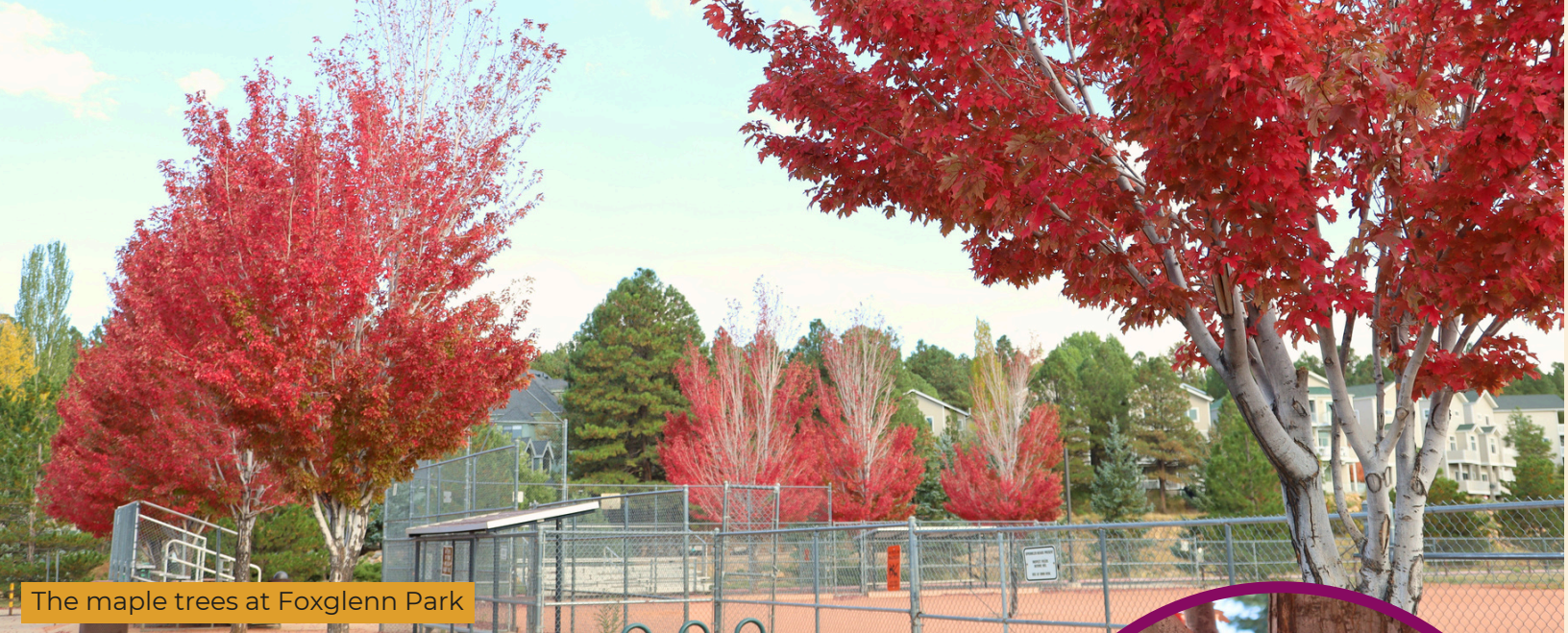
The maple trees at Foxglenn Park