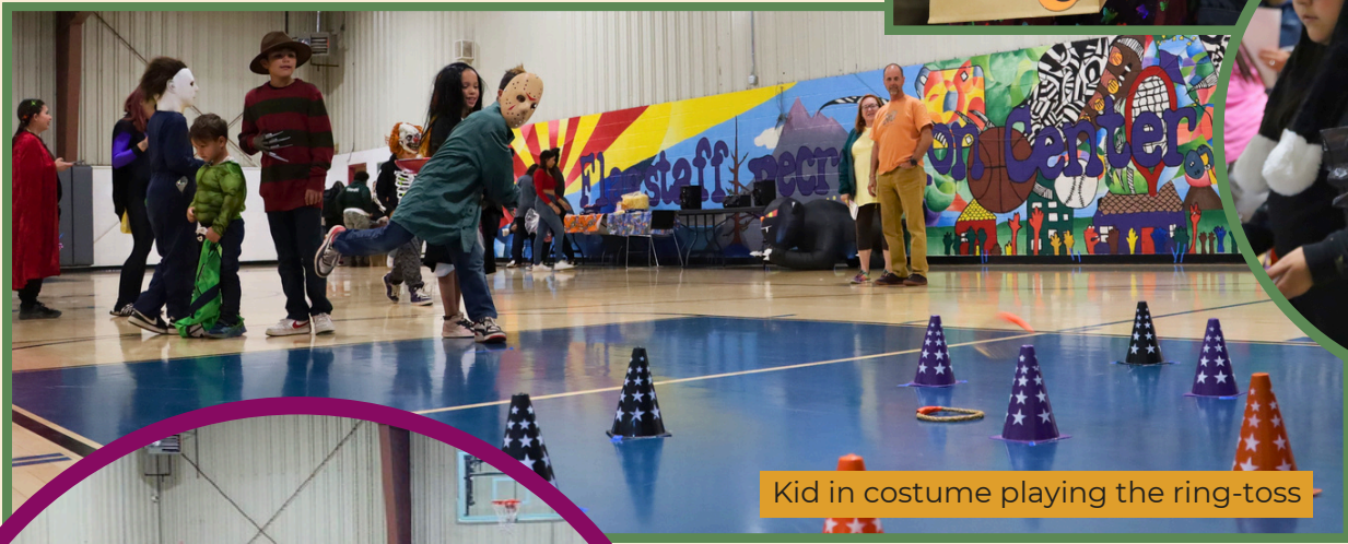
Kid in costume playing the ring-toss