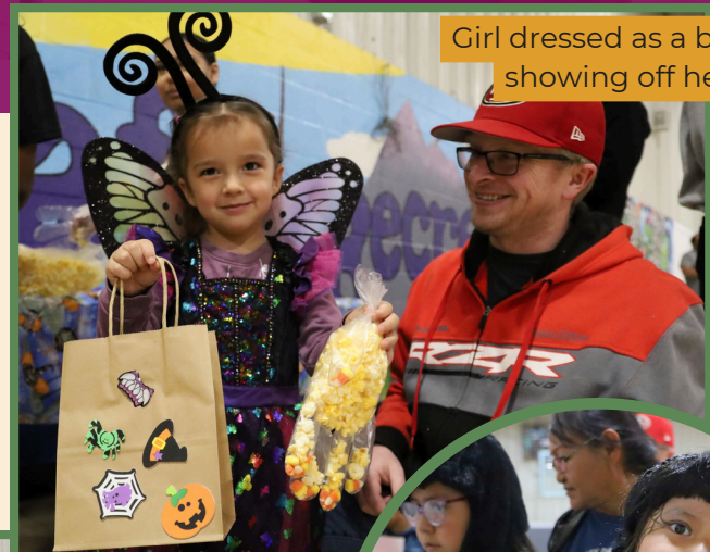
Girl dressed as a butterfly showing off her crafts

The Hal Jensen Halloween Carnival was a major success seeing over one-hundred people through the event. Kids and parents enjoyed playing fun games to win candy, making crafts to take home, and trying their luck at the ever so popular cake walk. The costumes were very creative, spooky, and cute!