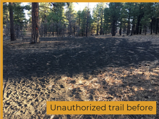
Unauthorized trail before

A group of staff from W.L. Gore volunteered a day out of their work week to help restore several unauthorized trails at Picture Canyon. Restoring unauthorized trails is imperative to preserving the area's natural state. New unauthorized trails appear frequently, but with the help of volunteers, Open Space is able to stay on top of this important task. In addition, this work helps fulfill the in-kind match to our AZ State Parks RTP (Recreational Trails Program) grant.