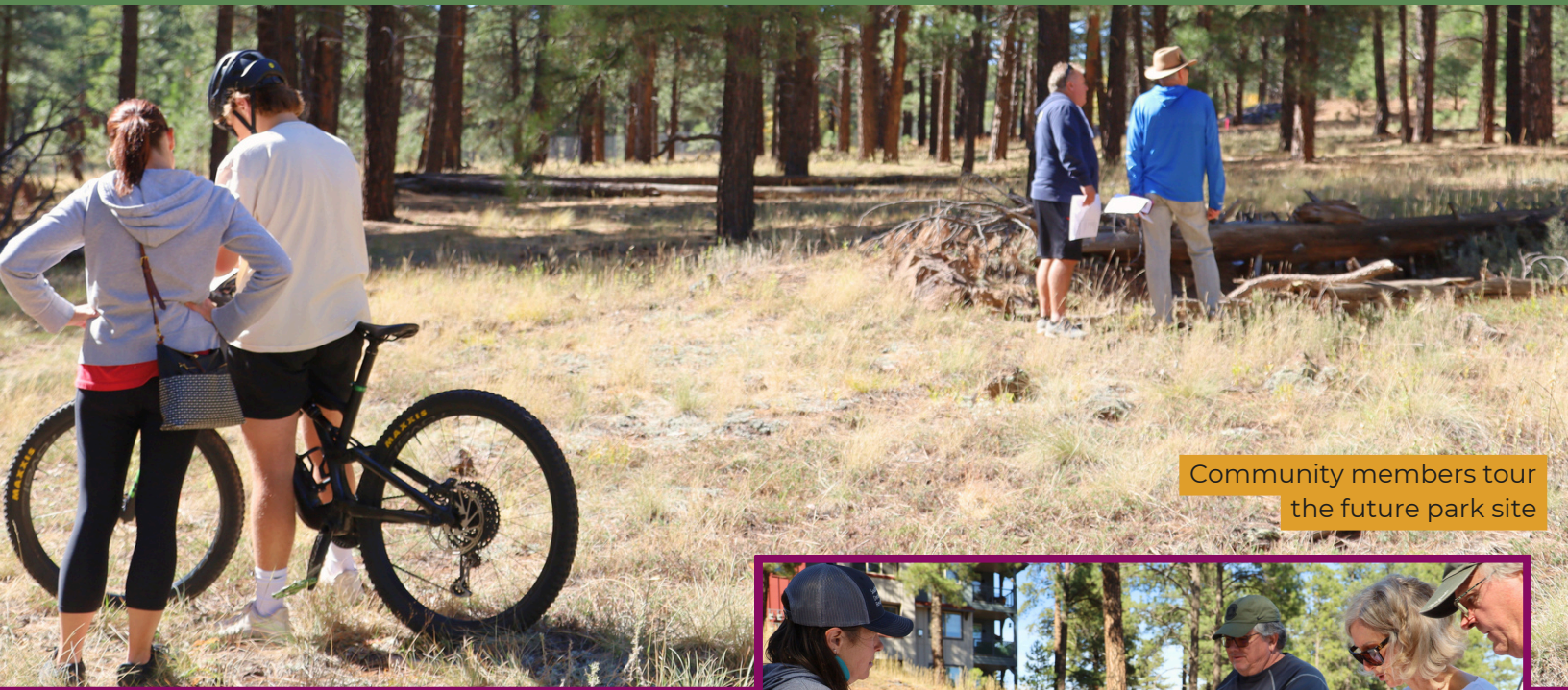
Community members tour the future park site

Connecting our community through people, parks, natural areas, and programs.