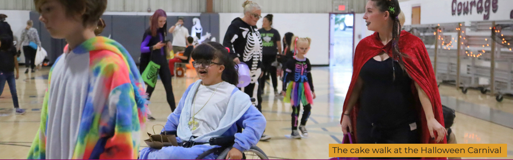
The cake walk at the Halloween Carnival