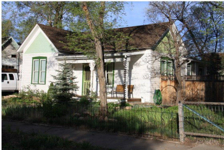
Restored childhood home of Senator Henry Ashurst, born in 1874.