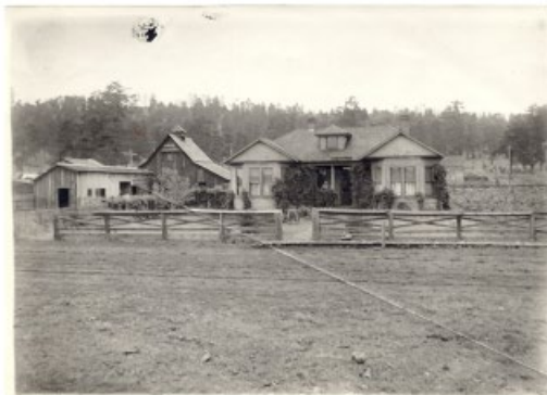
Prior to 1894.

25 January 2024 Sustainability Commission presentation