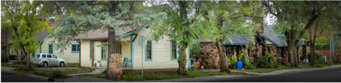
Townsite CLT's first finished project: "4 Square."