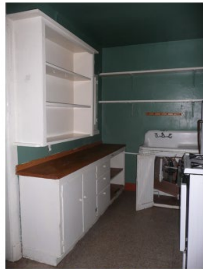
4 Square project stone houses prior to restoration. Note the decorative use of obsidian in concrete sills and lintels. Also the 1900s kitchen.