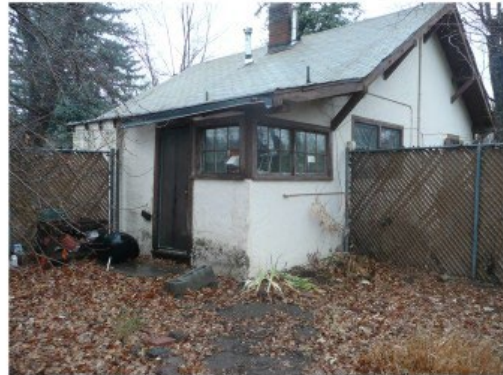
4 Square project frame houses prior to rehabilitation and restoration. Flagstaff has had no property maintenance ordinance, but may soon.