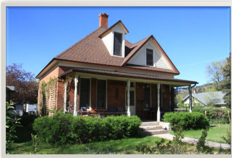
1 st N. Arizona weather station, and home of US Senator H. Ashurst .