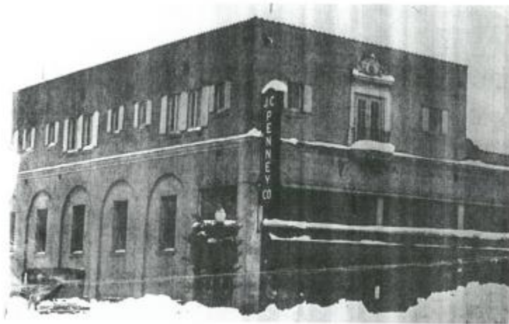
3 of 5. Late 1920s photo of the JC Penney building from the SE