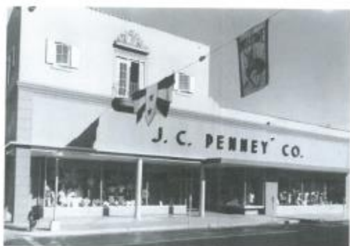
4 of 5. Early 1960s photo of the JC Penney building from the SE