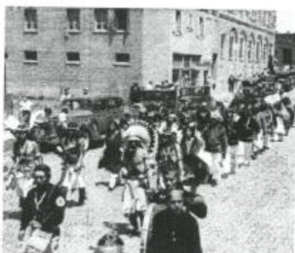
5 of 5. Photograph from Coconino Sun of Indian Pow Wow parade on Aspen Ave. Taken from SW. Photographer stood in front of the Orpheum.