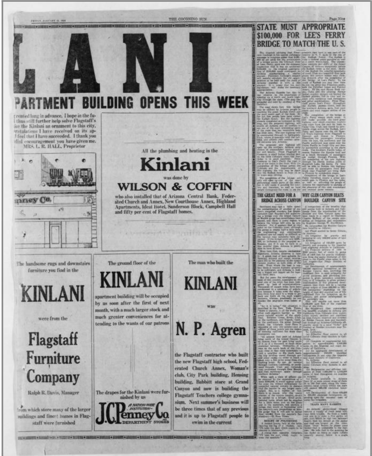
Advertisement in The Coconino Sun for opening of the Kinlani apartments The Coconino Sun (Flagstaff, Arizona), January 15, 1926, Page 9