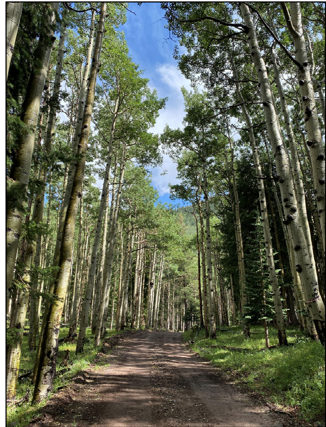
Waterline Road – Inner Basin