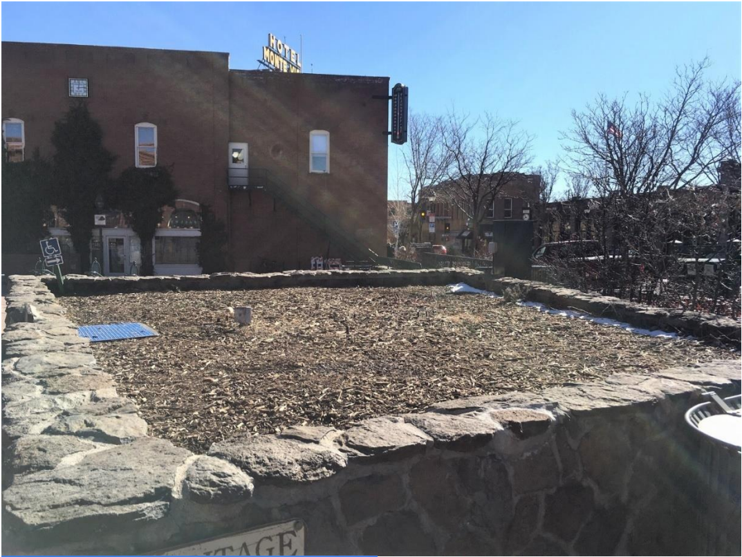
Image 2: Large Planter at Heritage Square (top) and image 3 and 4: planters along Aspen Avenue. All pictured planters have existing plantings with perennials from 2020 and prior; this is to fill out planters with additional perennials and annuals for a colorful effect.