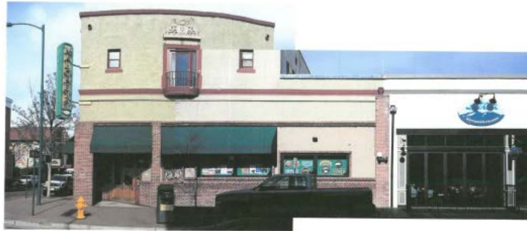
MALONEY ' S TODAY