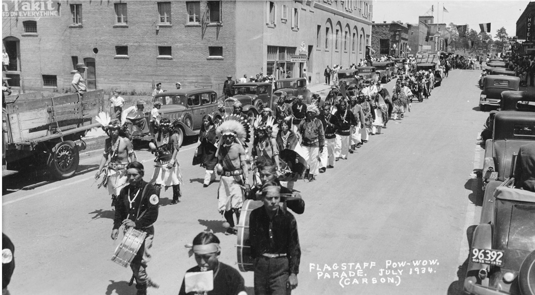
FLAGSTAFF POW-WOW, PARADE, JULY 1934. (CARSON)