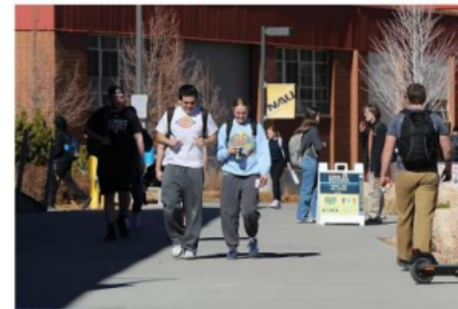
Flagstaff's winter starts as one of the driest on record, as fire concerns rise Thursday 2/6 at 8:00am