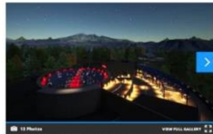
Arizona has a huge new observatory. Here's a look at what you can see and do at the new Marlyne Maclean Johnson Discovery Center at Lowell Observatory in Flagstaff, Arizona.