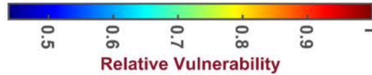
Coconino County Vulnerability Map