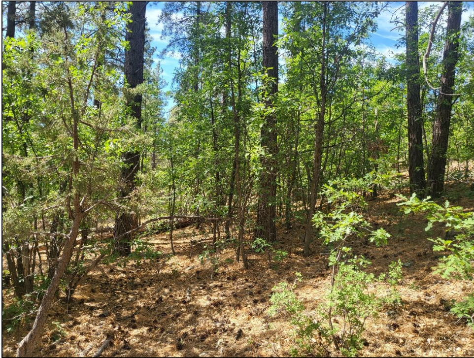
Photograph 3. Project overview of eastern slopes, facing south.

EnviroSystems also consulted General Land Office land patent and plat map records. The original 1878 GLO plat map depicts Flagstaff approximately 2 miles to the west and an overland road (presumably the Beale Wagon Road) more than a mile to the north, but nothing within Section 14 except for trees and contour lines. No other supplemental GLO plat maps had any information pertaining to Section 14. Land patent records show that the SW \frac{1}{4} of Section 14 was originally purchased by Charles Begg in 1890 through Sale-Cash Entry (3 Stat. 566), but no other entries were found that covered the current project area.