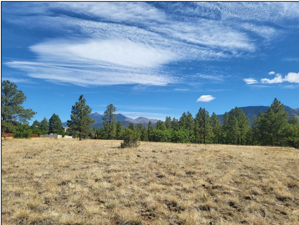
Photograph 2. Project overview, facing north.