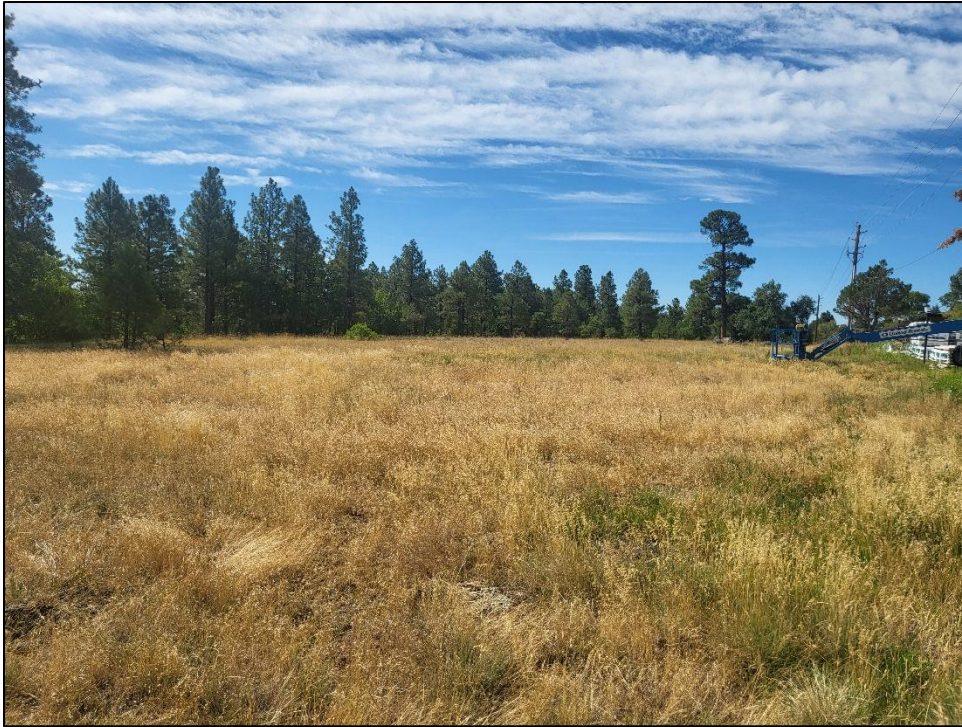
Photograph 1. Project overview, facing south.