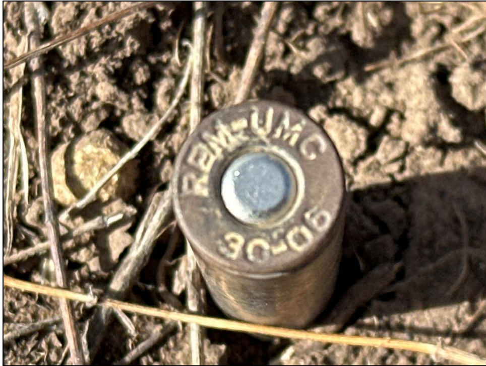
Photograph 4. IO 1, unfired rifle cartridge.