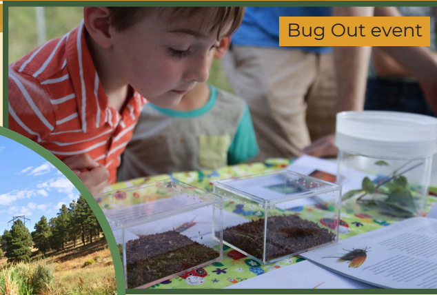
Bug Out event