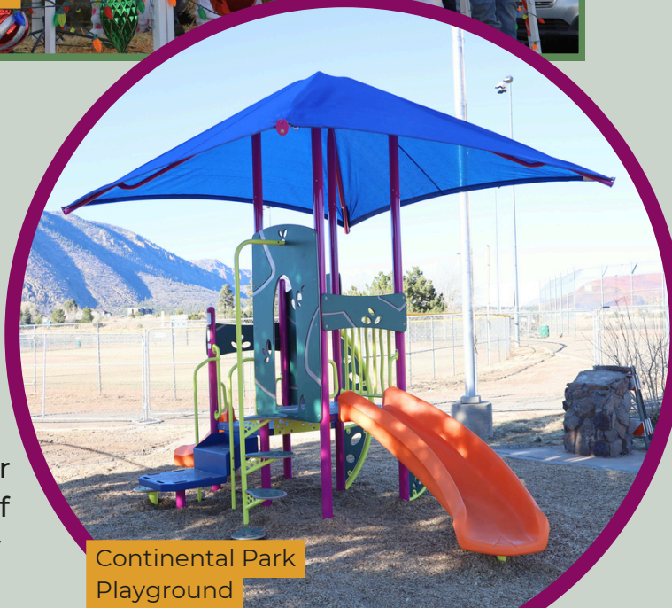
Continental Park Playground

Parks installed a new playground structure at Continental Park. The new structure is designed for children ages two to five. It is located with a view of the three main fields so families can enjoy the new amenities while watching youth sports.