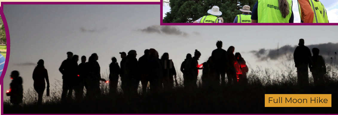
Full Moon Hike