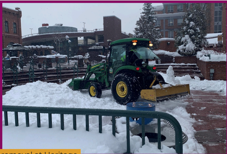
Snow removal at Heritage Square

During the month of January, there were 1,090 labor hours spent on snow operations with 70% of those hours on equipment and the rest with performing handwork, i.e. shoveling or snow throwing. During the month, 61.4 inches of snow accumulation occurred becoming the third largest on record for Flagstaff! When using the standard of an inch of snow per square foot weighs 1.25 pounds, Parks estimates that over 87 million pounds of snow were moved during the month.