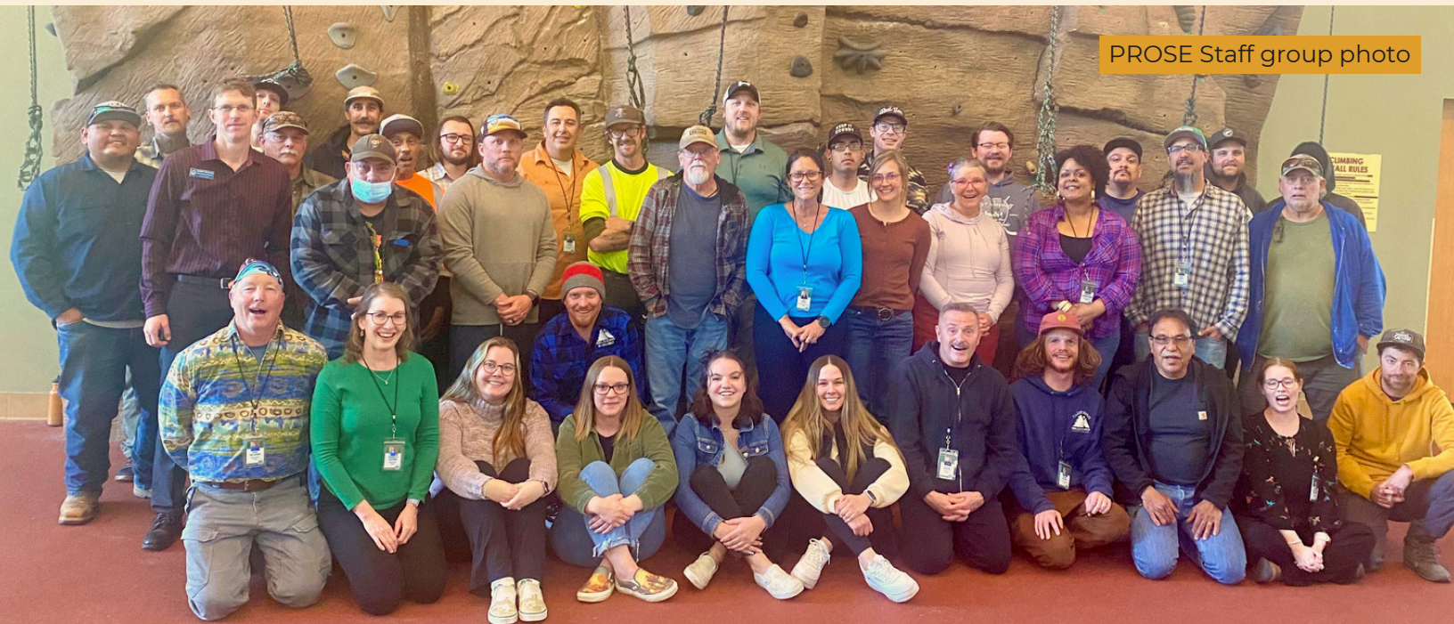
PROSE Staff group photo

As 2024 comes to a close, I am filled with pride as I reflect on the incredible achievements of our PROSE team this year. It has been a year of growth, innovation, and dedication, and I'm excited to highlight the many milestones we've reached together.