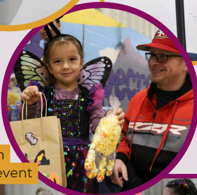
Halloween Carnival event