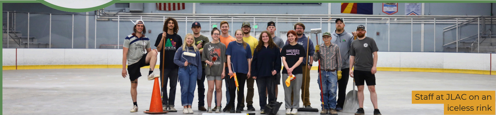
Staff at JLAC on an iceless rink