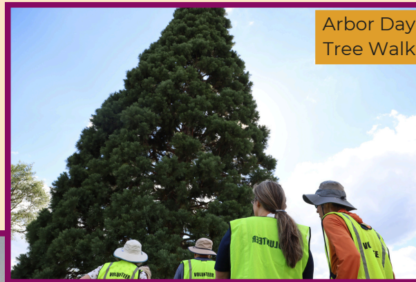
Arbor Day Tree Walk