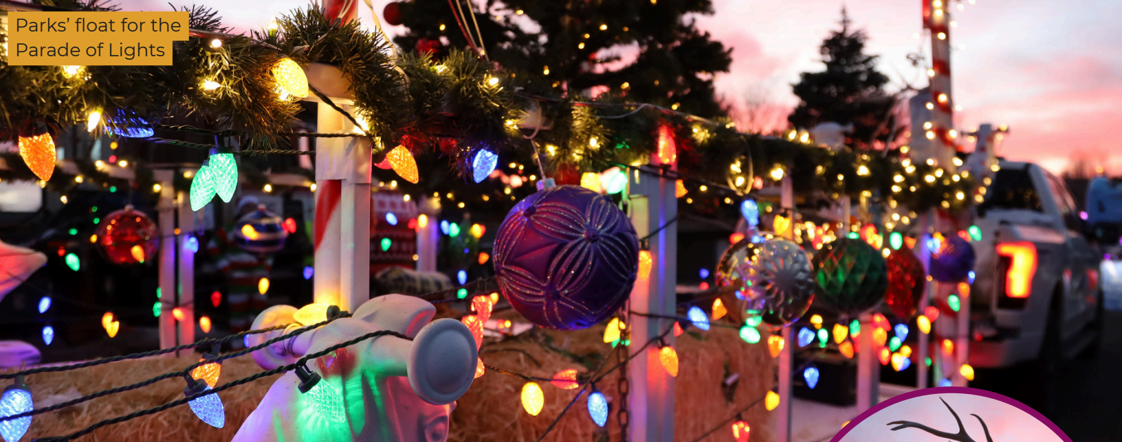
Parks' float for the Parade of Lights