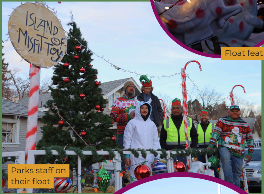
Parks staff on their float

Parks staff got in the holiday spirit by participating in the Chamber of Commerce Parade of Lights. A small team of staff designed and decorated a float, based on the Island of Misfit Toys, utilizing retired playground equipment. This was a great way to connect with the community and have some fun.