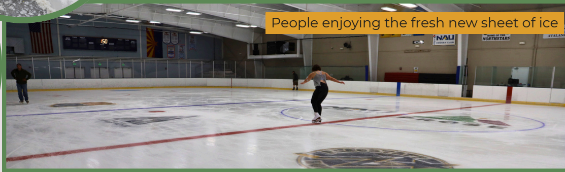
People enjoying the fresh new sheet of ice