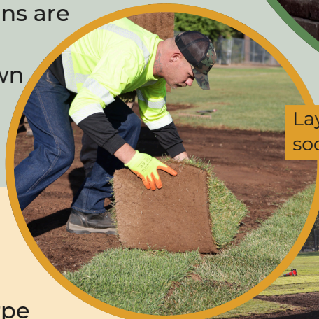
Laying the new sod

Parks is excited to have begun the process of replacing existing park kiosk signs with new metal signs designed by Parks staff themselves. These signs are a much-needed improvement from the previous signs, which break down over time due to sun exposure. This year, the Parks team upgraded seven signs throughout Flagstaff.