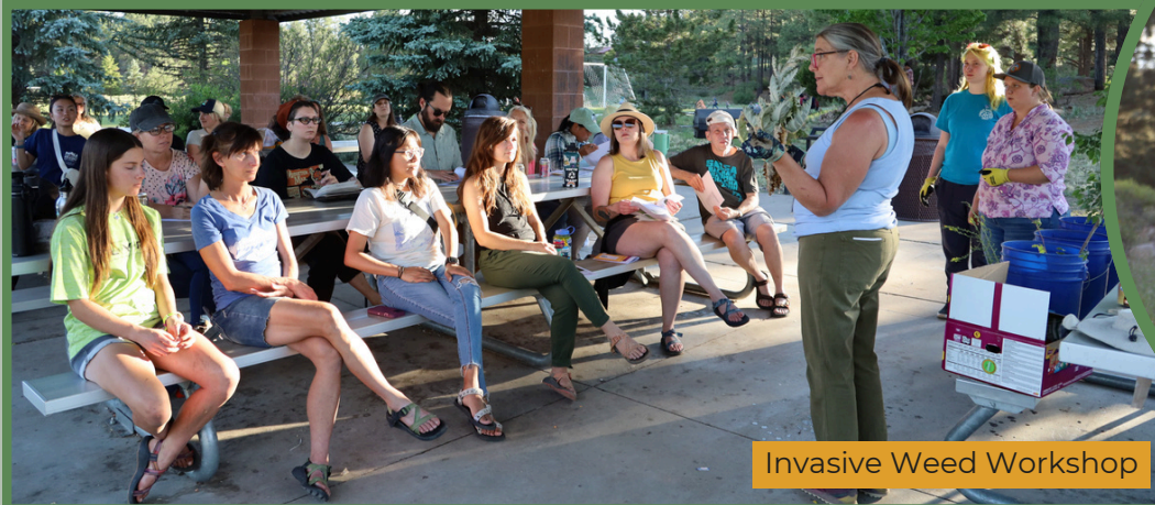
Invasive Weed Workshop

Open Space continued to host another successful round of Wednesday Weed Pull events at Picture Canyon over the summer. They also introduced a new Volunteer Weed Pull and Workshops Series in partnership with the City of Flagstaff Sustainability Community Stewards Program. This event series tackled weeds on other City properties, urban trails, and along the Rio de Flag. In addition to these new educational series, Open Space hosted many other groups to conduct volunteer work on all three Open Space properties throughout the year.