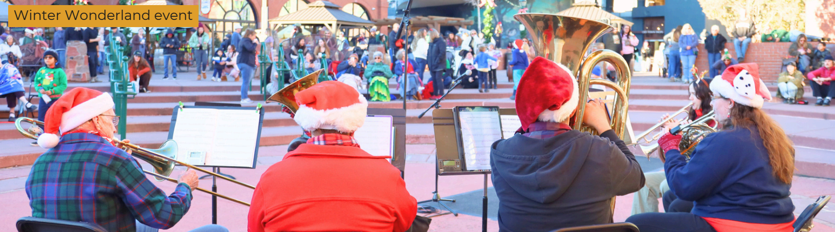
Winter Wonderland event