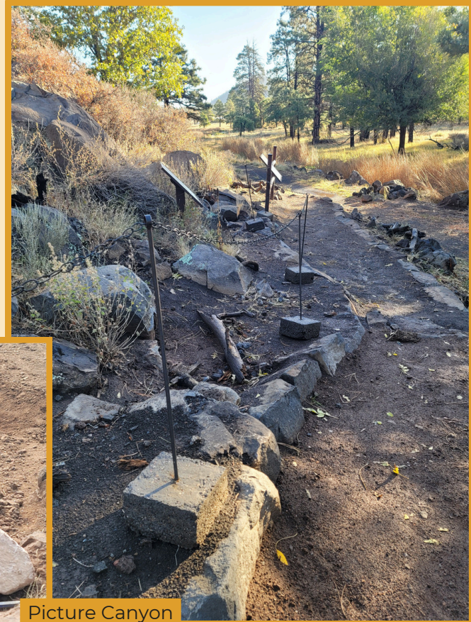
Picture Canyon restoration work

Over the course of the year, four miles of restoration work was completed at Picture Canyon with the help of the Arizona Conservation Corps and one hundred and eighty-five people who volunteered a total of 589 hours of work. The Arizona Conservation Corps also completed installing stone steps at the Petroglyph Overlook and re-routed the trail at the Waterbird Petroglyph Site so that it is no longer right up against the boulders with petroglyphs, which invited scratched graffiti.