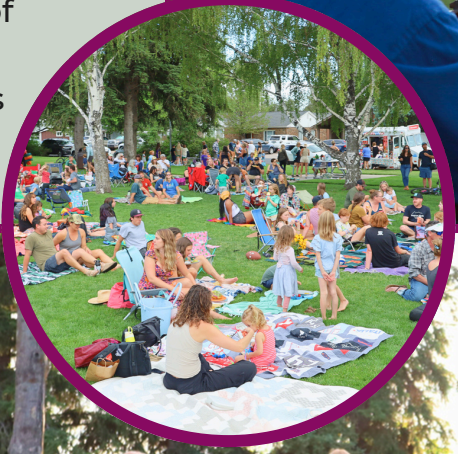
Concerts in the Park