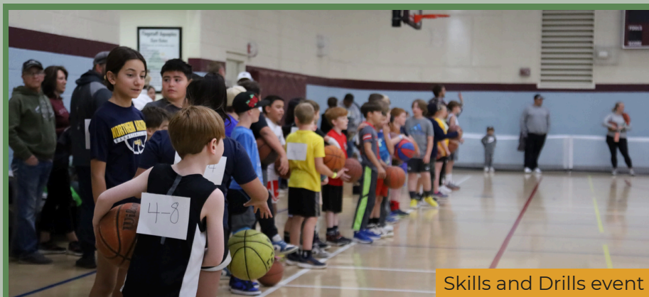
Skills and Drills event