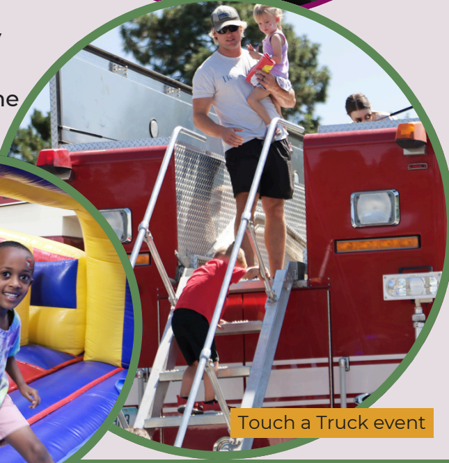
Touch a Truck event