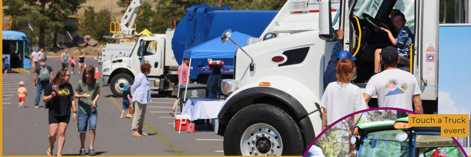
Touch a Truck event