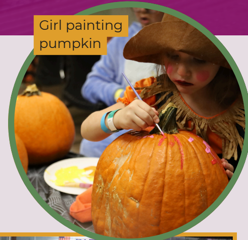
Girl painting pumpkin

October was packed with Halloween events for the whole family. The Aquaplex introduced a new event called the Pumpkin Plunge where participants could swim in a pool full of floating pumpkins and take one home. Hal Jensen Recreation Center hosted a Halloween Carnival with over one hundred visitors through the door, and Jay Lively Activity Center hosted their annual Spooky Skate event that saw more attendees than any other year.