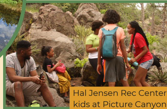
Hal Jensen Rec Center kids at Picture Canyon