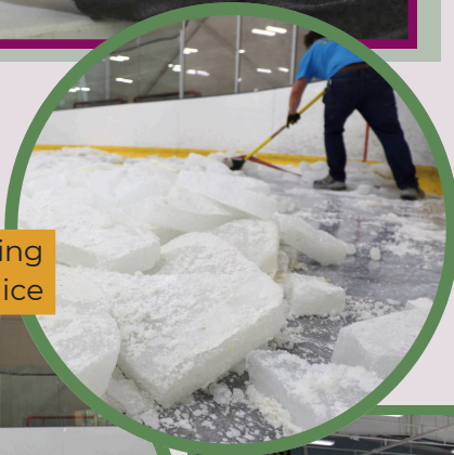
Removing the ice

Jay Lively Activity Center managed to complete many large projects during the annual cleaning and maintenance closure, including the removal of the entire sheet of ice in order to fix cracks in the surface. This project was a tremendous undertaking and could not have been done without the hard work of all the staff at Jay Lively who went above and beyond their normal duties. Sincere gratitude goes out to staff from JLAC as well as City Facilities for assisting with the complex projects. The fresh ice and clean facility have been appreciated by all.