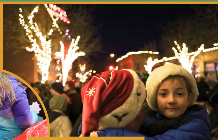
Winter Wonderland event

Another successful Winter Wonderland for the books! Thanks to the partnership with the Downtown Business Alliance and sponsors, around 6,500 people attended this event.