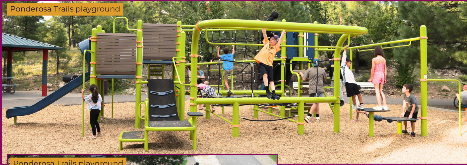
Ponderosa Trails playground aerial view