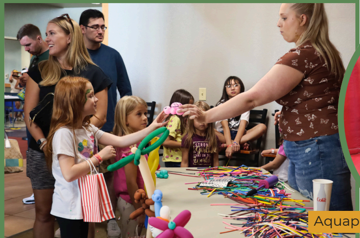
Aquaplex Carnival event