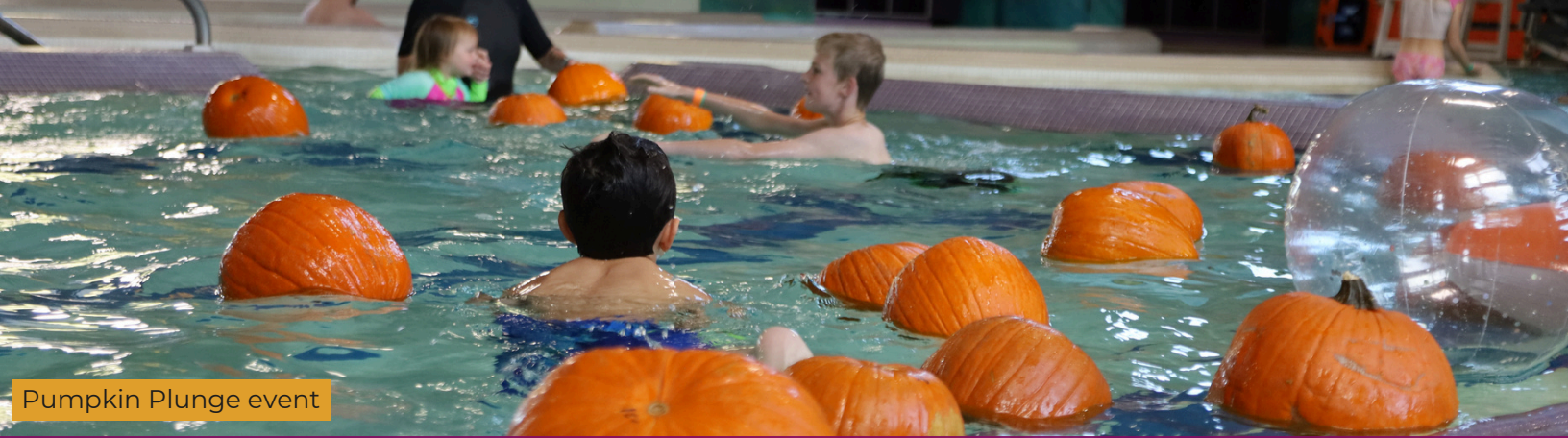
Pumpkin Plunge event