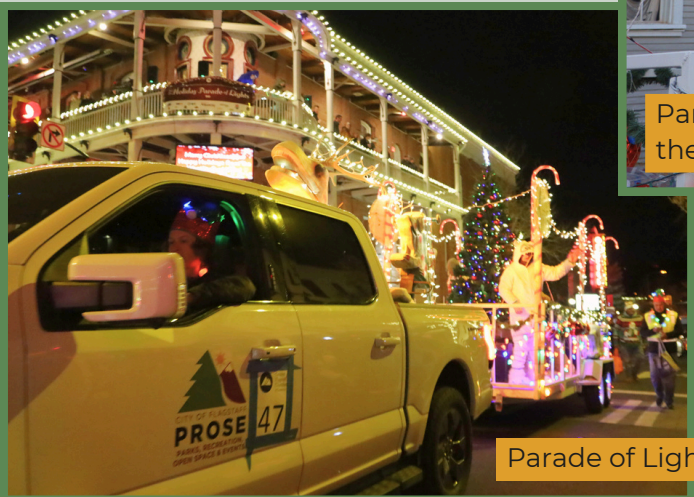
Parade of Lights