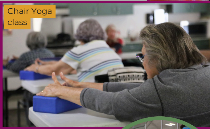
Chair Yoga class