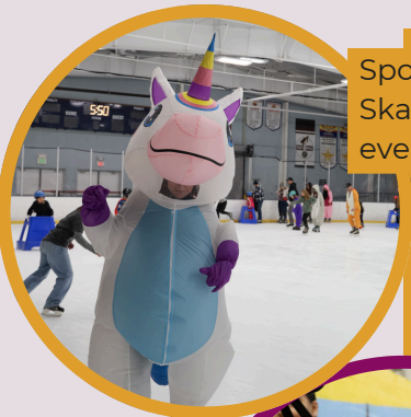
Spooky Skate event