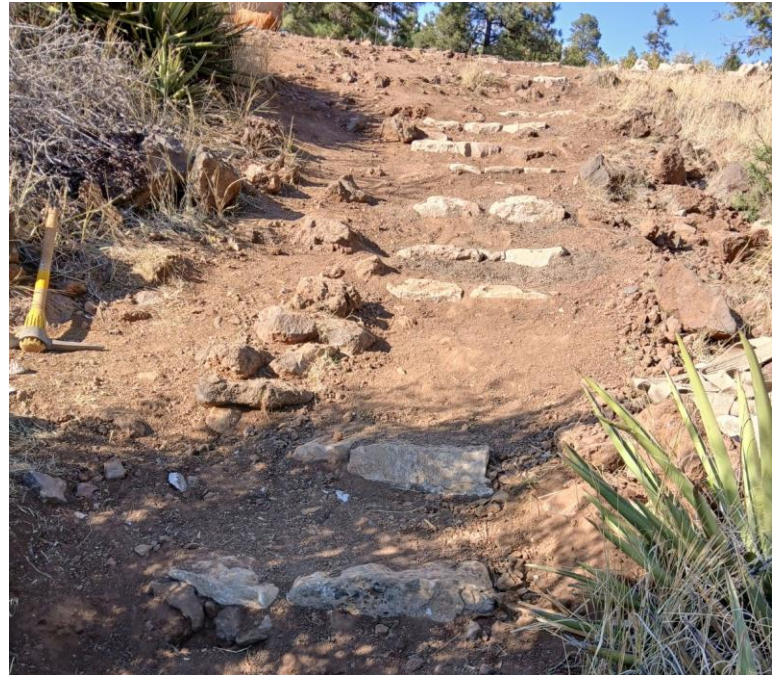
Petroglyph Overlook Stairs Installation