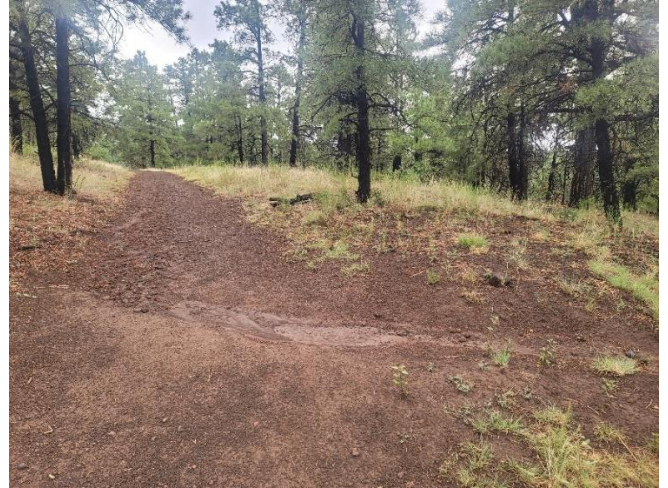
Tom Moody Trail Repairs Before and After