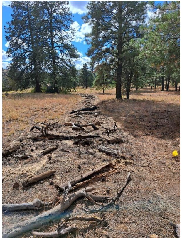
Unauthorized Road and Trail Resotration Before and After