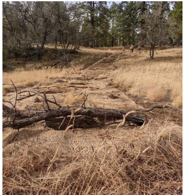
Unauthorized Road and Trail Resotration Before and After