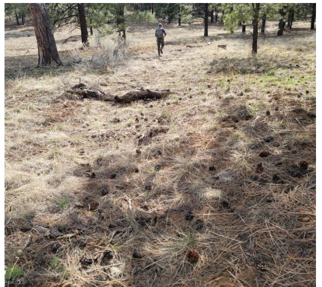
Unauthorized Road and Trail Restoration Before and After