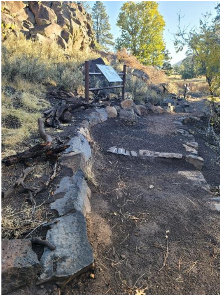
Waterbird Overlook Trail Reroute