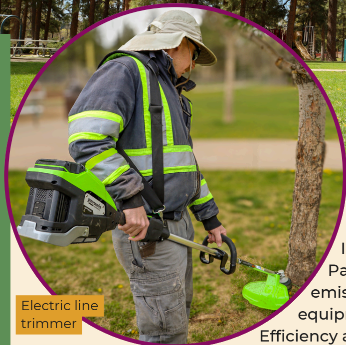
Electric line trimmer