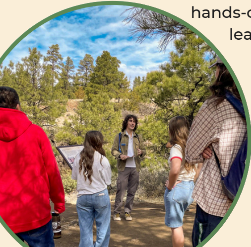
Field trip at Picture Canyon