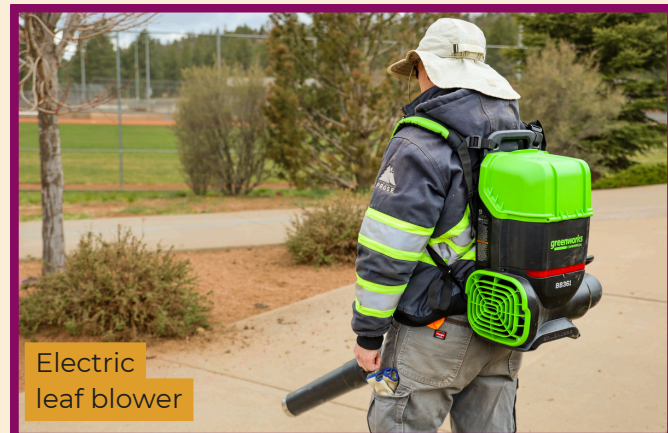
Electric leaf blower

In April, Parks received a suite of new electric tools. These included lawn mowers, leaf blowers, pressure washers, line trimmers, battery packs, and chargers. These energy-efficient tools have just recently deployed in the field, helping to reduce noise, improve air quality, and lower the City's overall carbon footprint. Parks is proud to contribute to Flagstaff's sustainability goals by integrating cleaner, quieter equipment into daily operations.