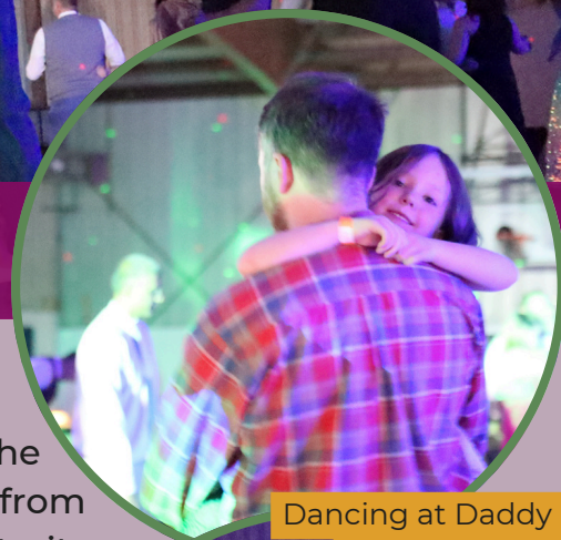
Dancing at Daddy Daughter Ball