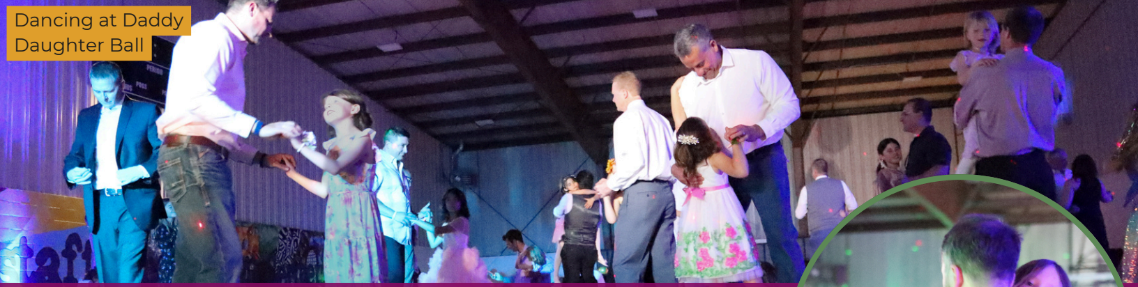
Dancing at Daddy Daughter Ball