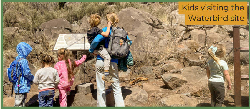
Kids visiting the Waterbird site

This spring, Open Space welcomed over 100 students and educators to Picture Canyon for hands-on, place-based learning: